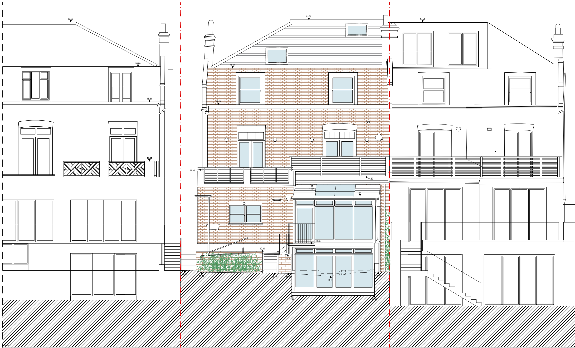
1 Rear Elevation in context scale 1:100