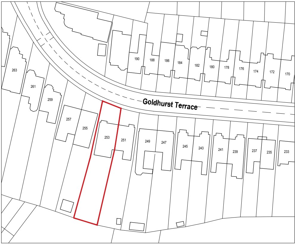
2 Location Plan scale 1:1250