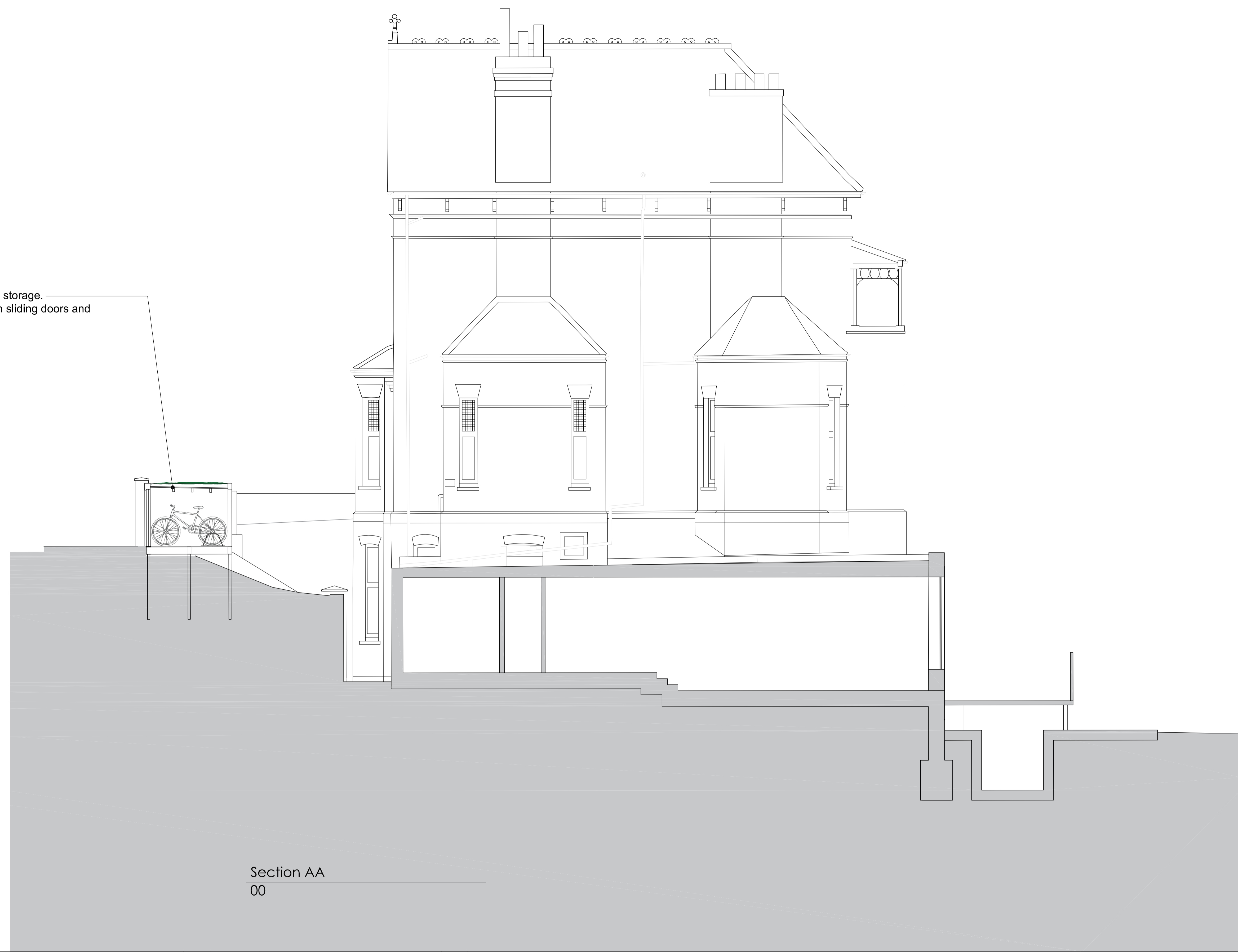
Section AA 00

New refuse and bike storage. Timber structure with sliding doors and green sedum roof