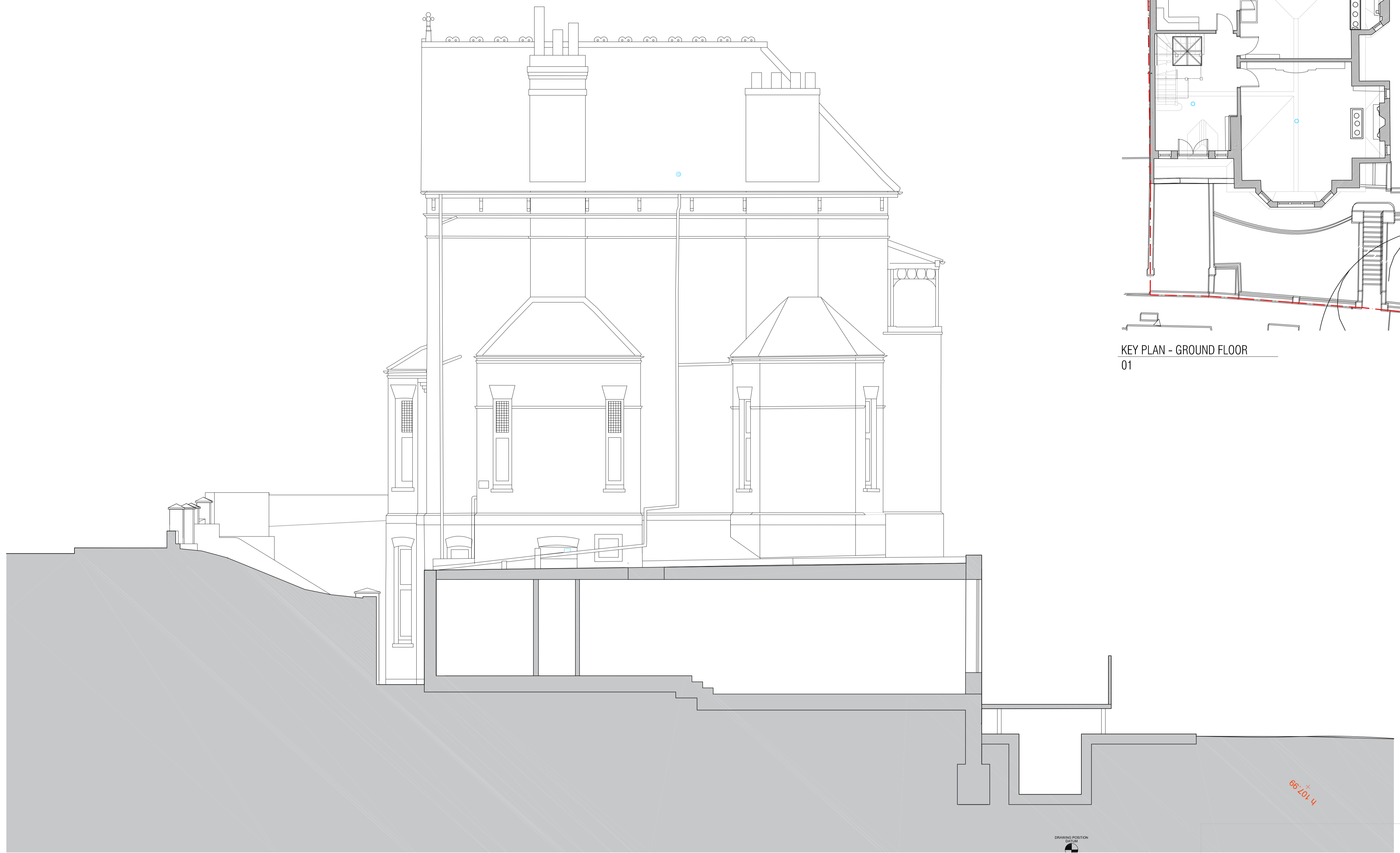
KEY PLAN - GROUND FLOOR 01