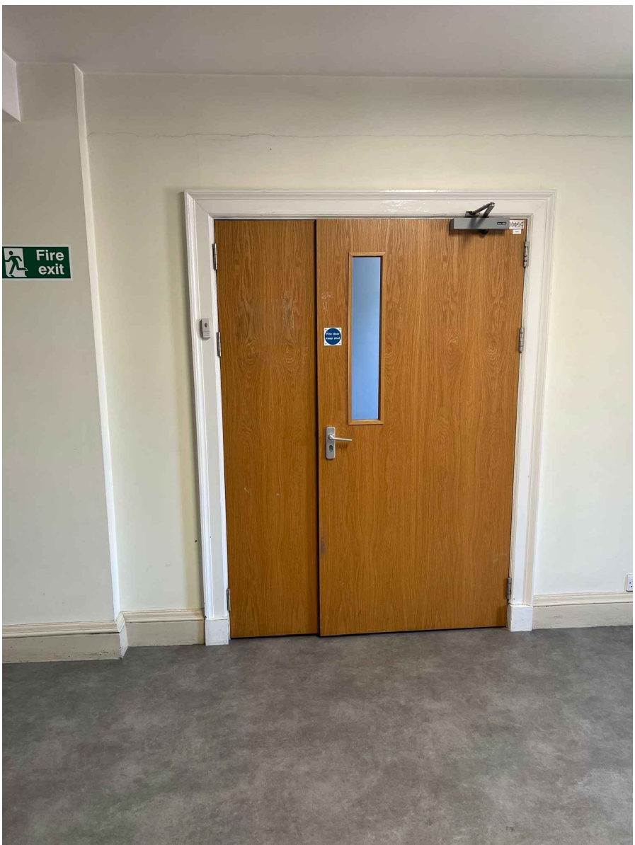
02 EXIST. ENTRANCE DOOR PHOTOGRAPH NTS