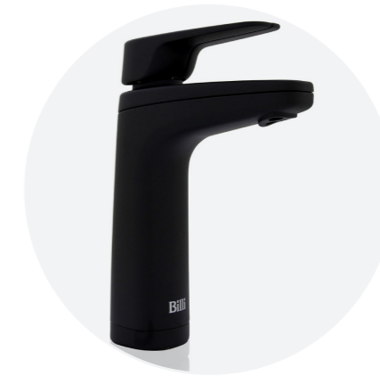
BLACK BILLI TAP Final specification TBC