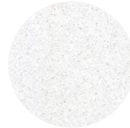
CORIAN WORKTOP (OR SIMILAR) Sparkling Granita