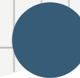
169 Steel Blue