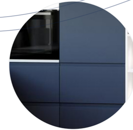
HOWDENS CABINET Clerkenwell Super Matt Navy