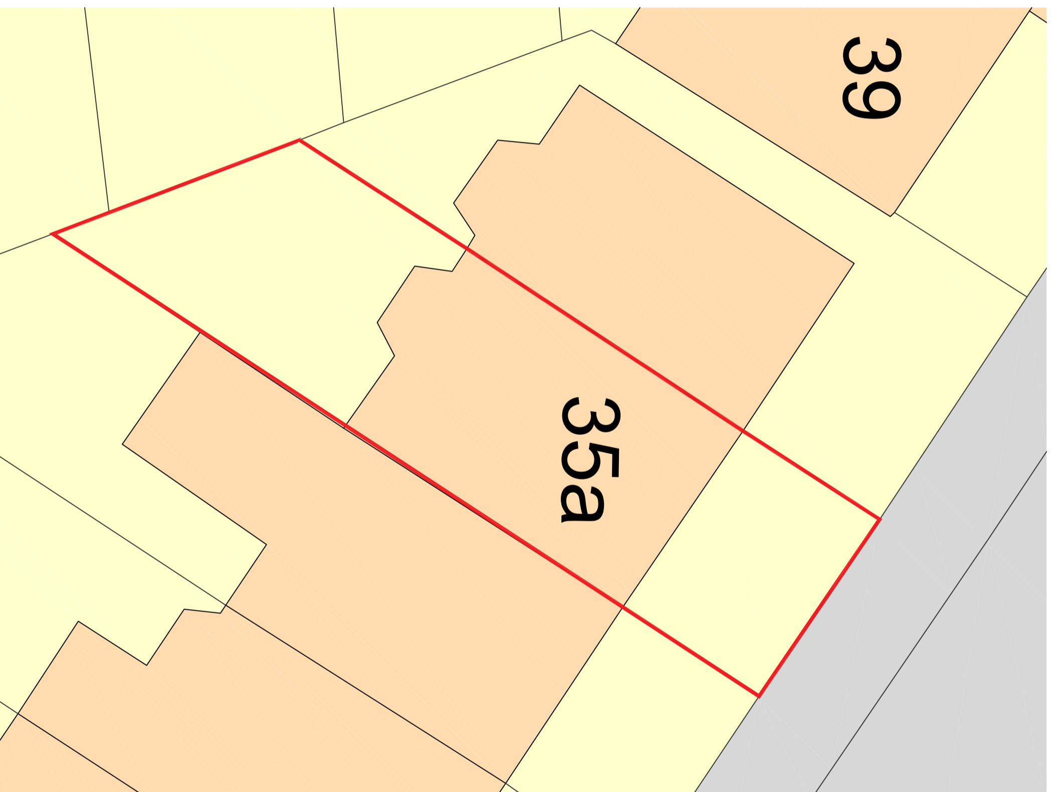
Site Plan - Scale 1:100