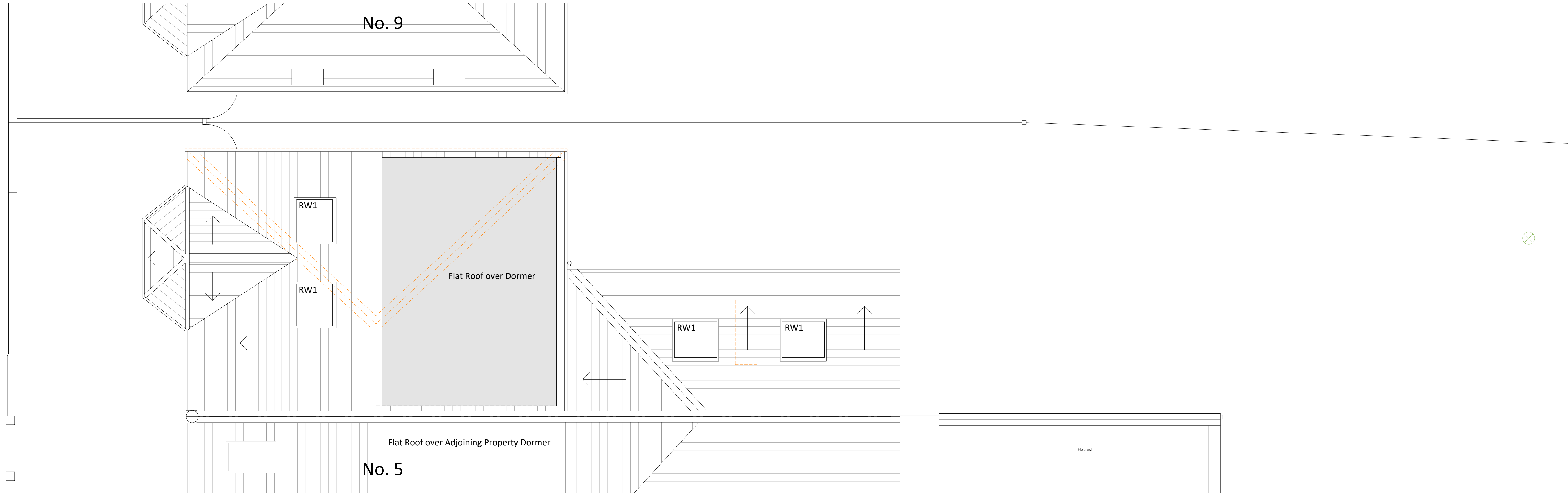
Proposed Roof Plan 1:50 Scale