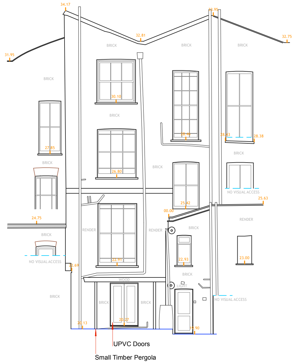
1 Rear Elevation Scale: 1:100