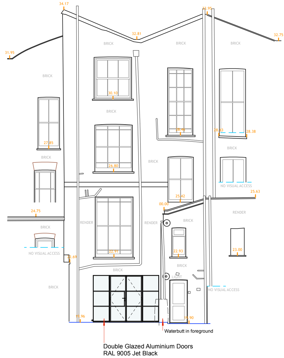
2 Proposed Rear Elevation Scale: 1:100