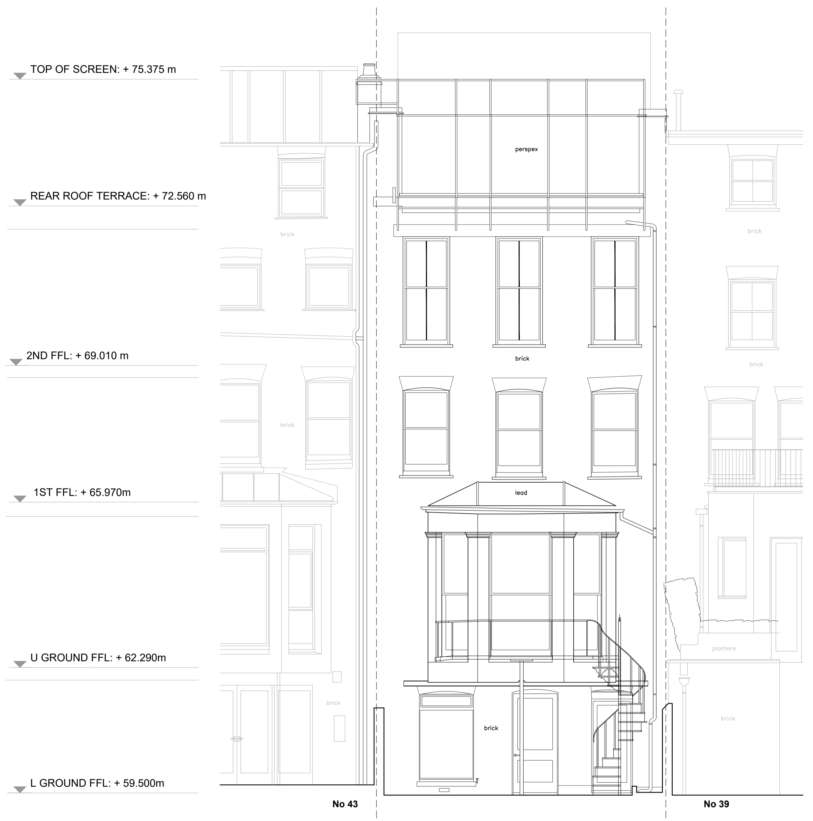
SW SOUTH WEST (REAR) ELEVATION SCALE 1:50 @ A1 & 1:100@A3

Disclaimer: This drawing is the exclusive property of AJA Ltd. The reproduction in whole or in part is prohibited without prior written consent of AJA Ltd. The contractor is to check and verify all levels, datum and dimensions and report any discrepancies to AJA Ltd prior to construction. Drawings are not to be scaled. AJA Ltd is not responsible for any dimensions of the site plan unless they are taken directly from a registered survey carried out by a licensed land surveyor. This drawing is to be read in conjunction with structural, mechanical, electrical and/or other consultant's documentation that is applicable to the project.