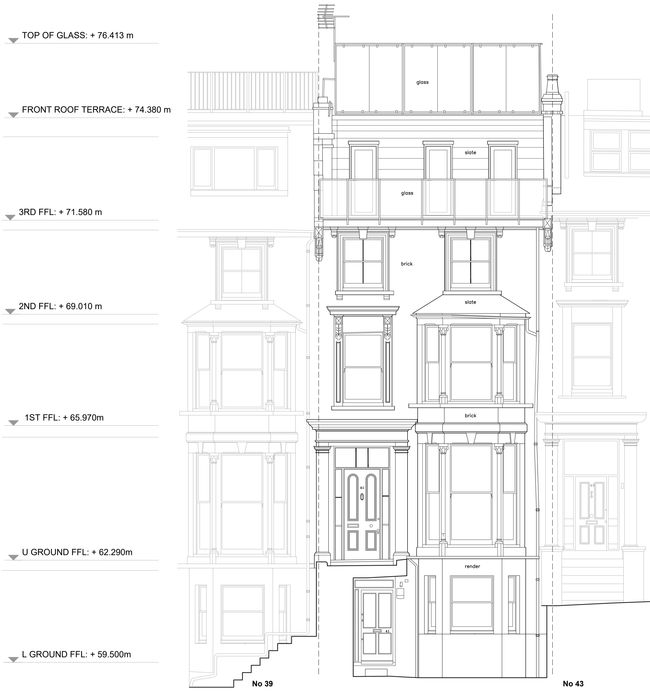
NE NORTH EAST (FRONT) ELEVATION SCALE 1:50 @ A1 & 1:100@A3