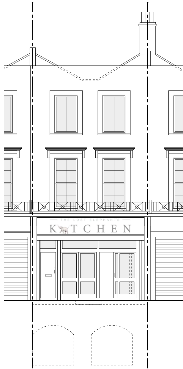
No. 16 No. 15 Chalk Farm Road No. 14