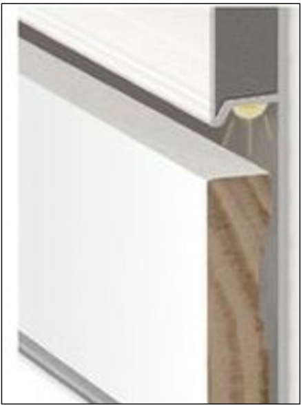
Skirting LED light detail