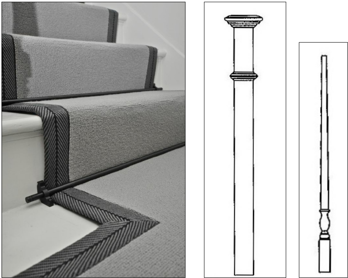
Runner Detail post spindle