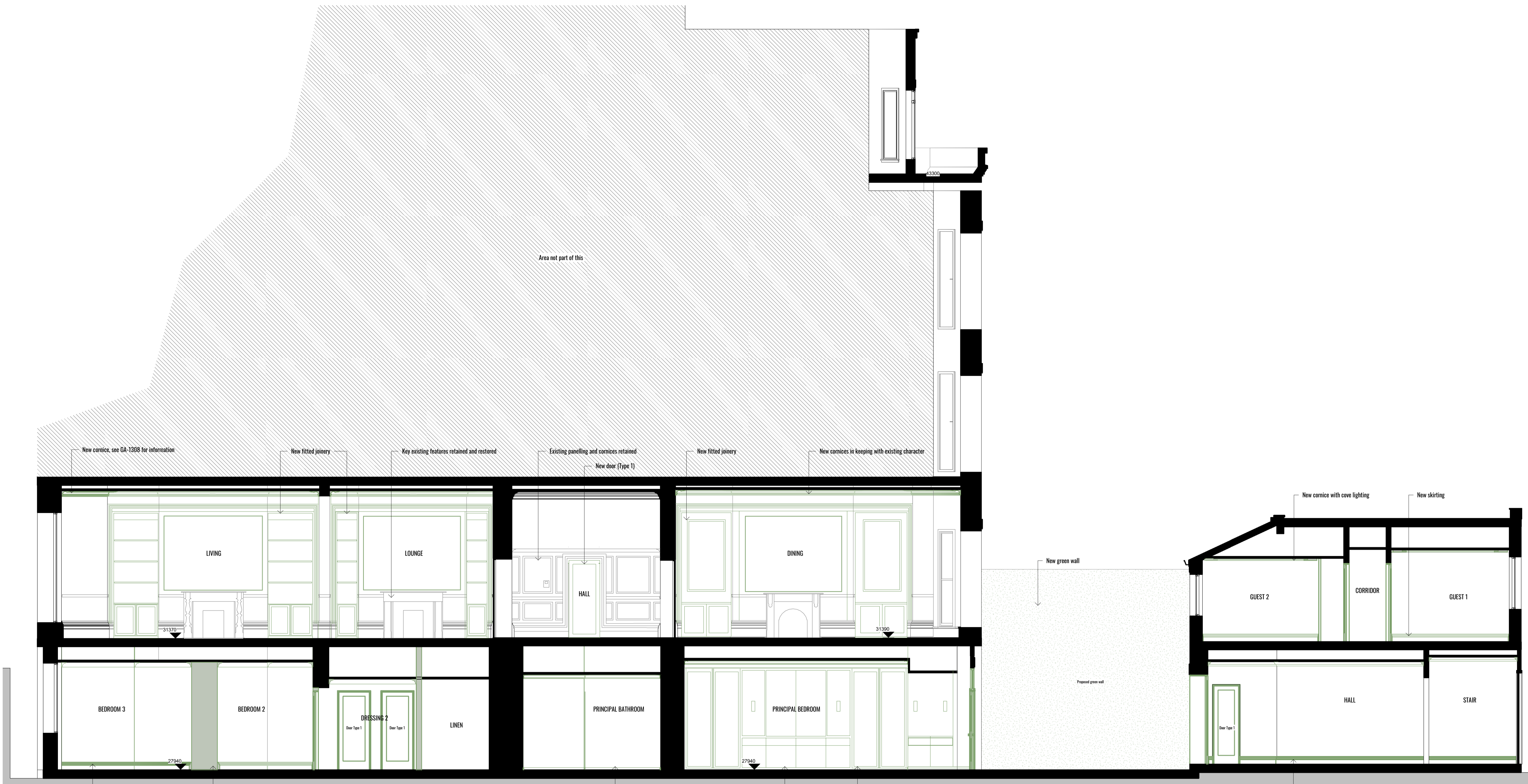
Proposed Section A-A 1:50

Roof Level 4385 1st 4384 1st 3900 1st 3900 Main House 1st 2794 Main House 1st 2794 Main House 1st 2794 Main House 1st 2794