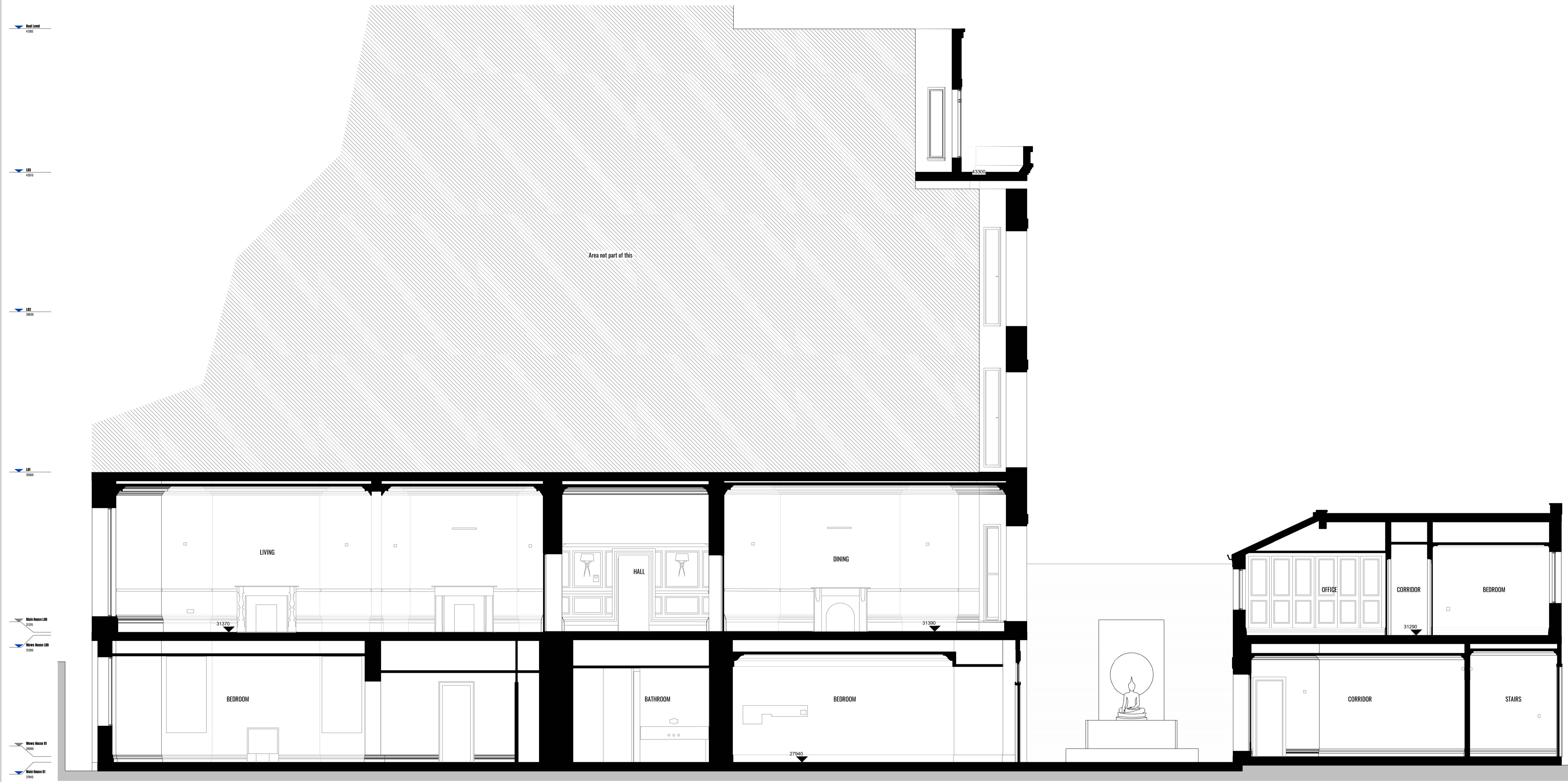
EXISTING SECTION A-A 1:50