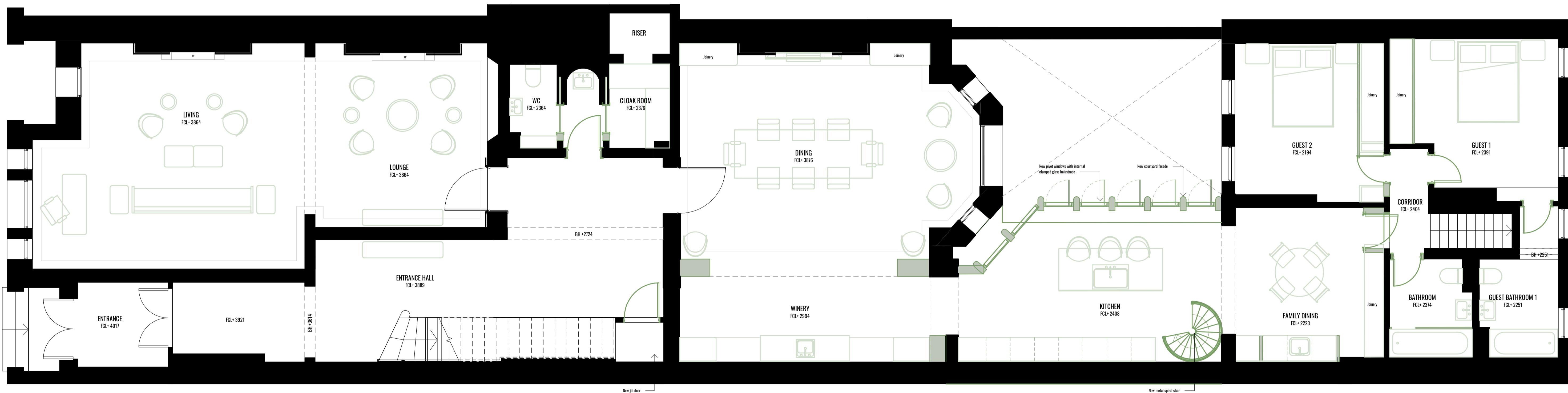
Ground Floor Proposed Plan