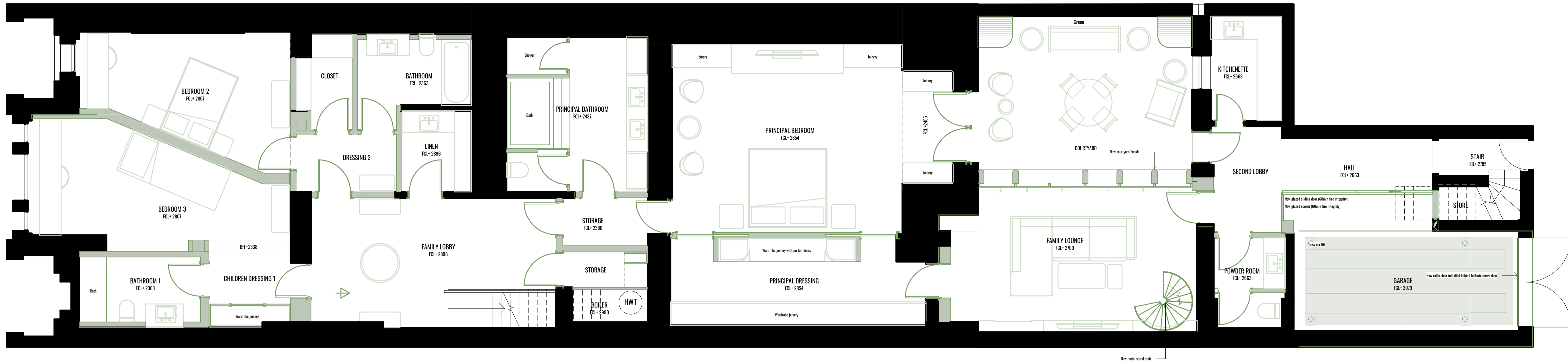
Lower Ground Proposed Plan