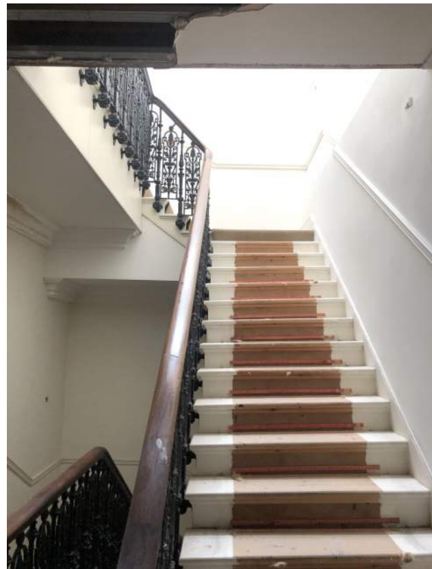
1. Stair grips to be removed. Blaustrade and railing to be repaired and refurbished