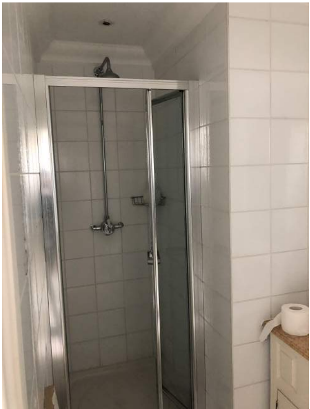
2. Sanitaryware fittings and associated services, joinery, tiles and cornice to be replaced