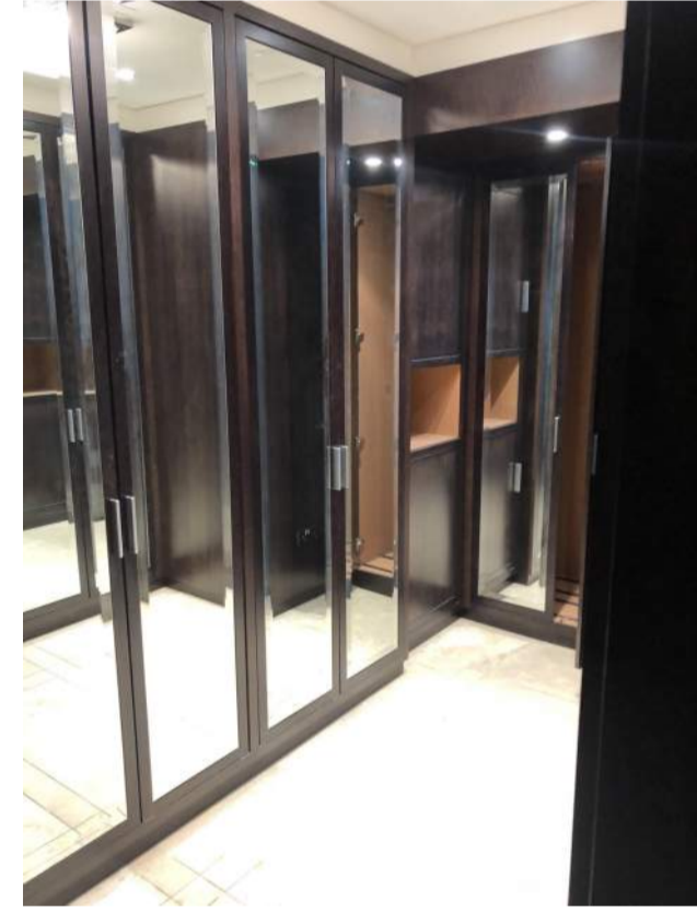
2. Dressing room joinery to be removed and finishes to be replaced