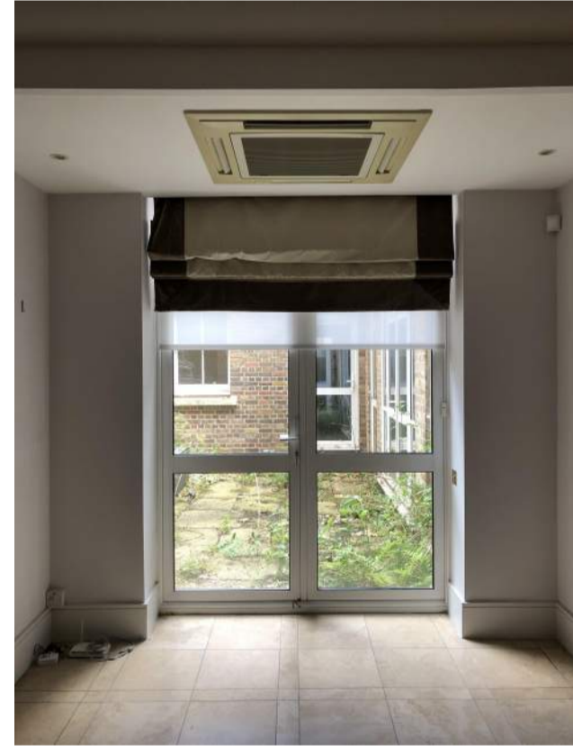
5. Double door to courtyard to be replaced. Services and finishes to be removed.