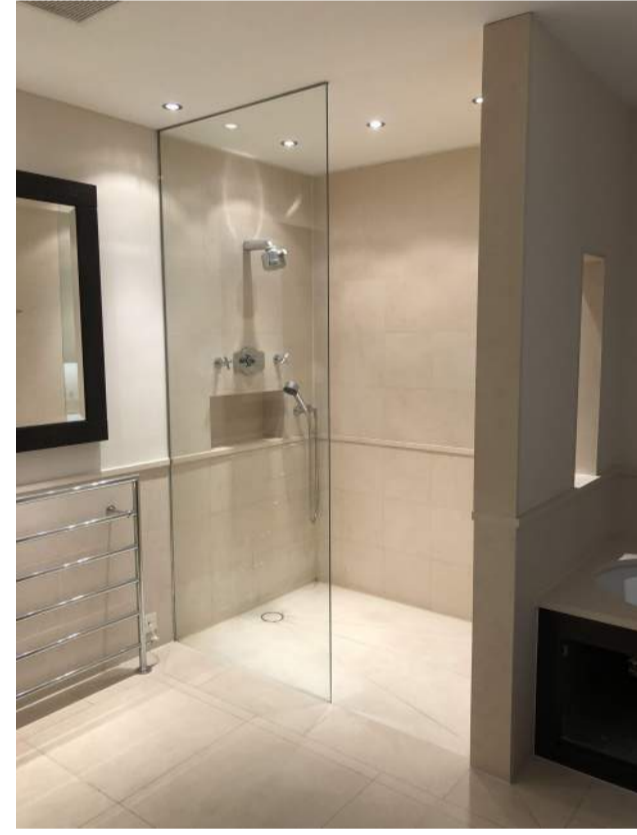
4. Finishes and bathroom suite to be replaced