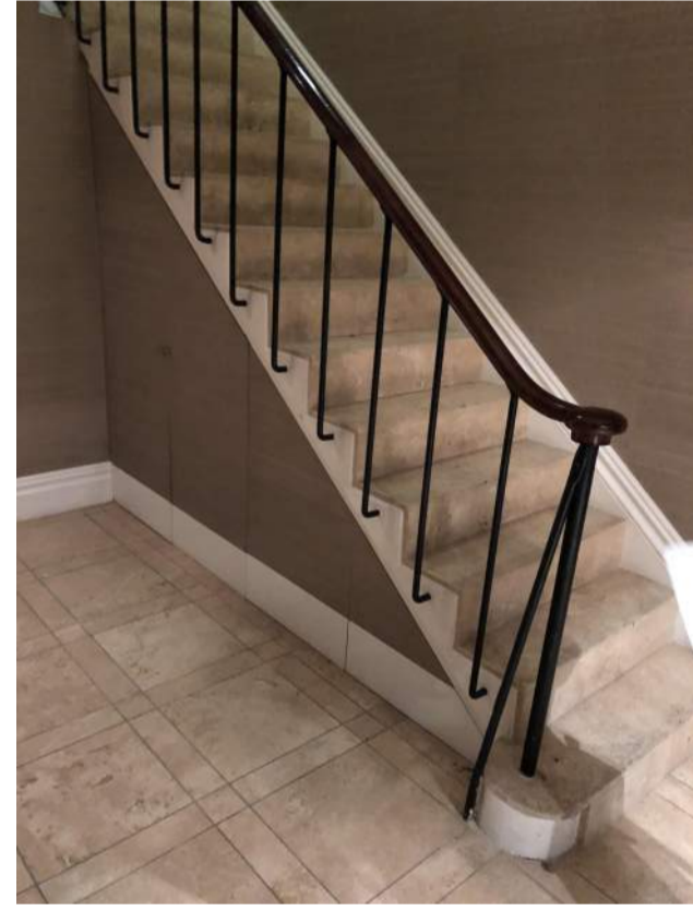
3. Wallpaper, floor finishes and non-original skirtings to be removed