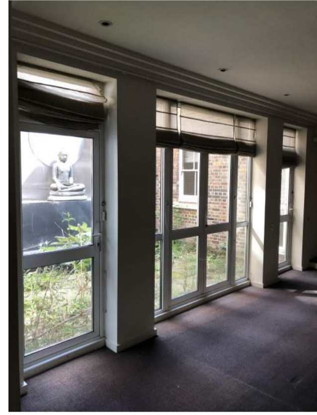
7. Wall with associated doors, windows and finishes to be removed. Floor finishes to be removed.