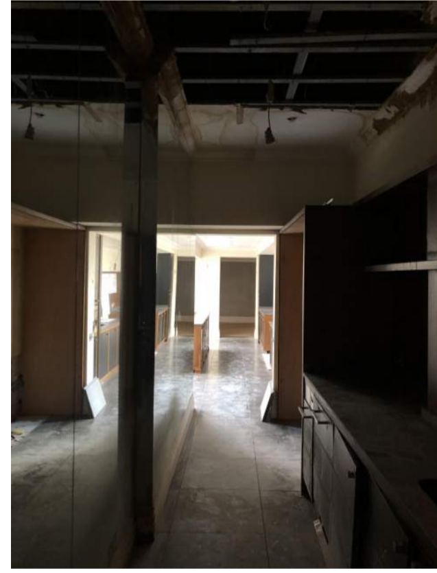
6. Water damage to soffit to be repaired. Joinery to be removed. Floor finishes to be replaced.