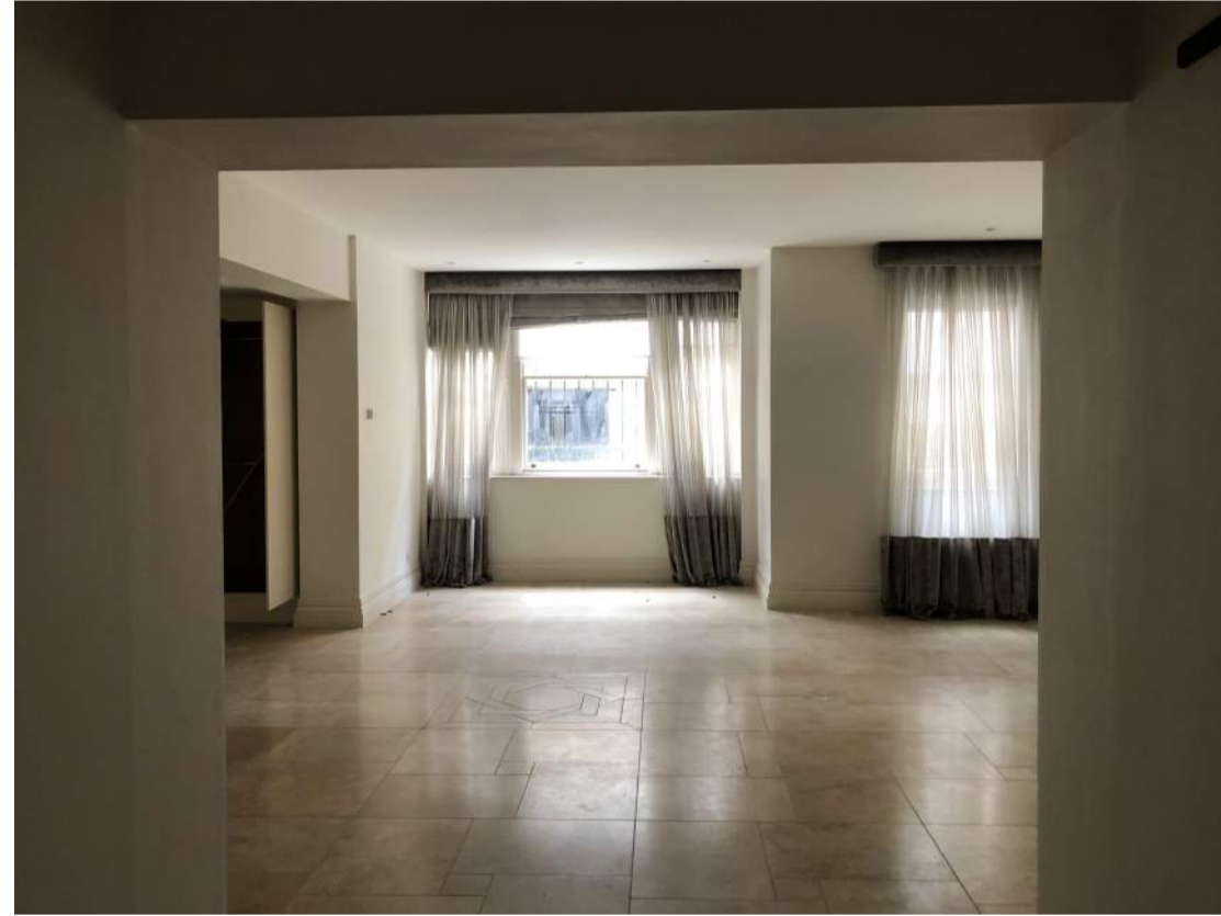
1. Lower ground floor bedroom. Floor finish to be replaced. Internal partitions reconfigured. Joinery removed.