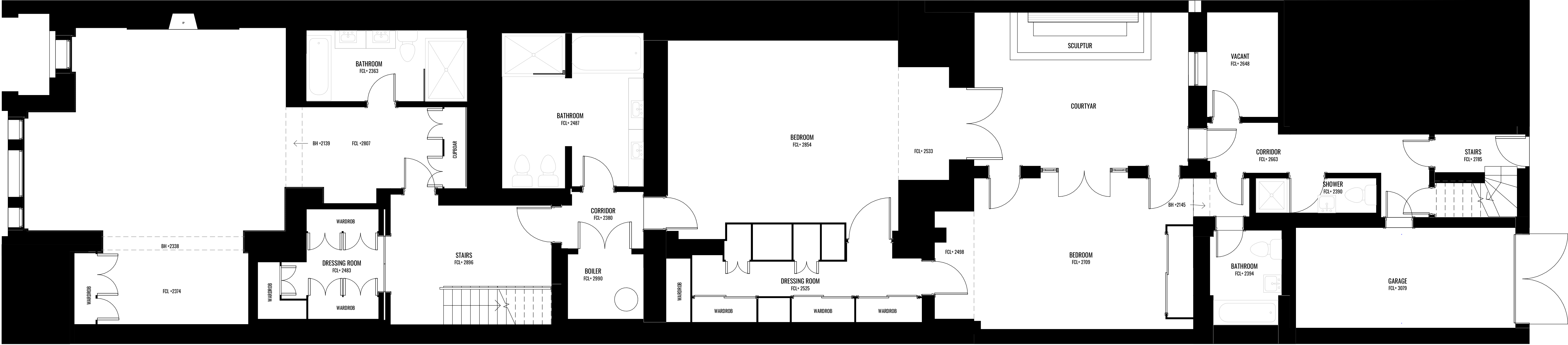
Existing Lower Ground Floor Plan 1:50