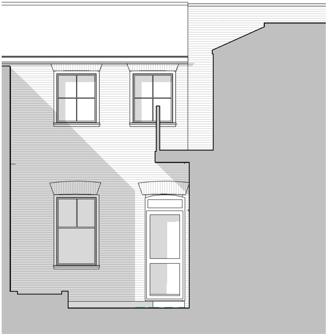
Courtyard Existing West Elevation 1:50