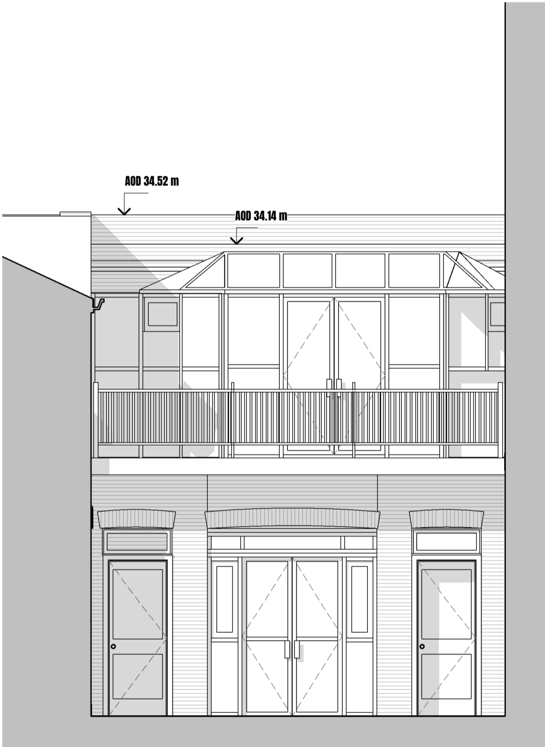
Courtyard Existing North Elevation 1:50