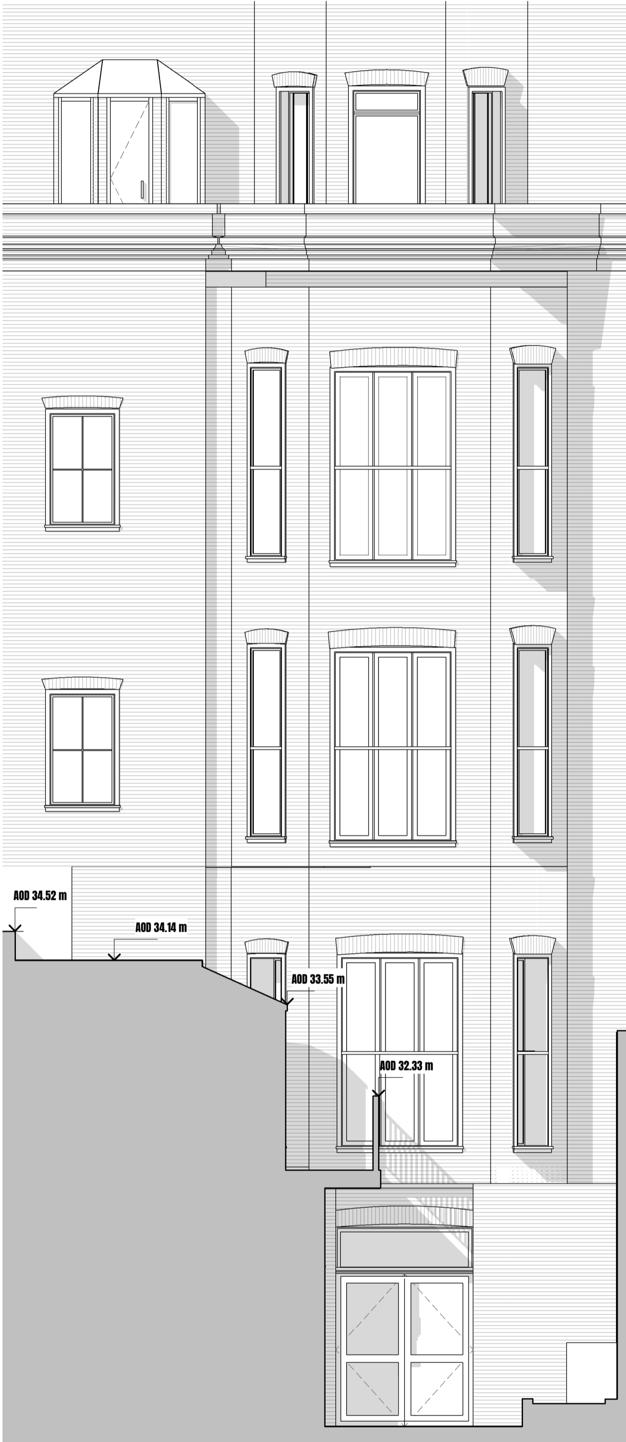
Courtyard Existing East Elevation 1:50

Down Farmer Architects Ltd is incorporated in England & Wales. Company registration number 10861309.