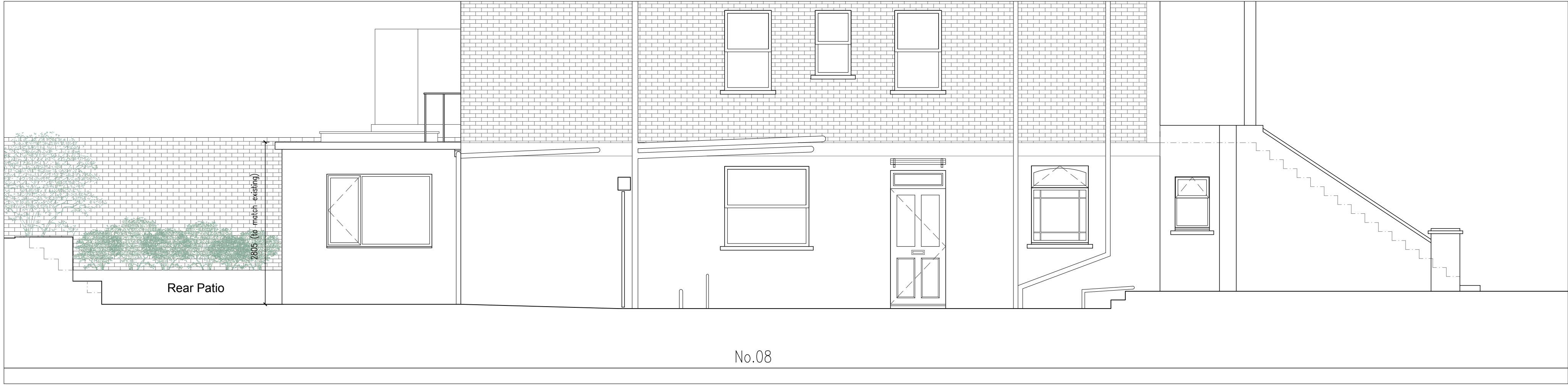
Proposed South West | Side Elevation (lower ground level only) Scale 1:100 @ A3 | 1:50 @ A1