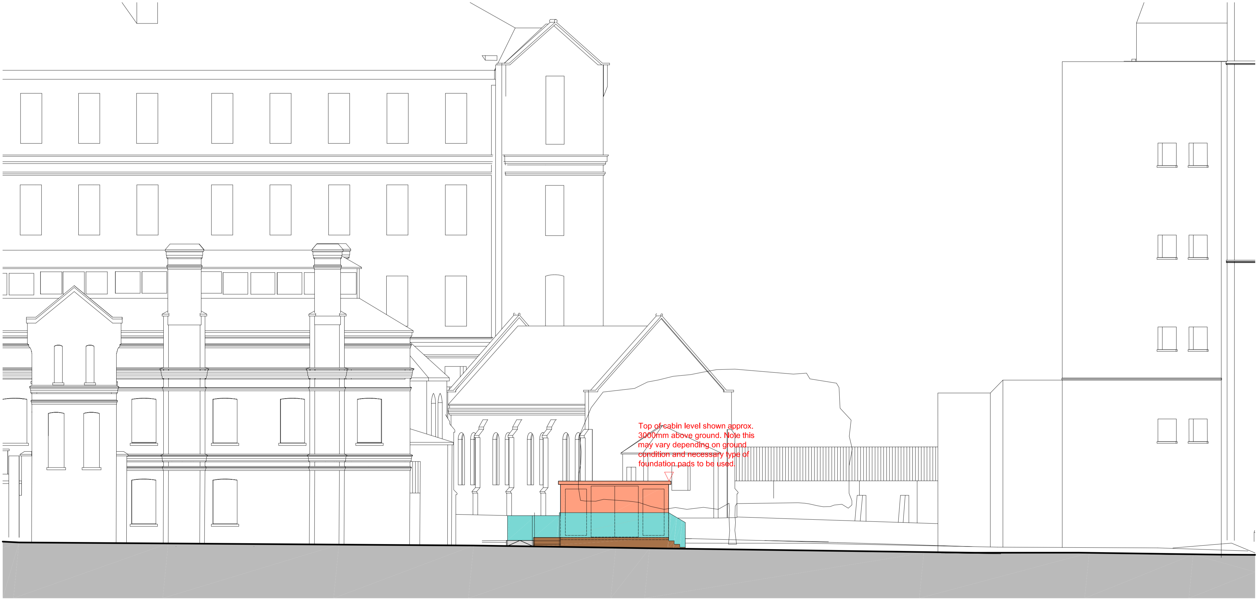
SOUTH ELEVATION - PROPOSED (SIDE)