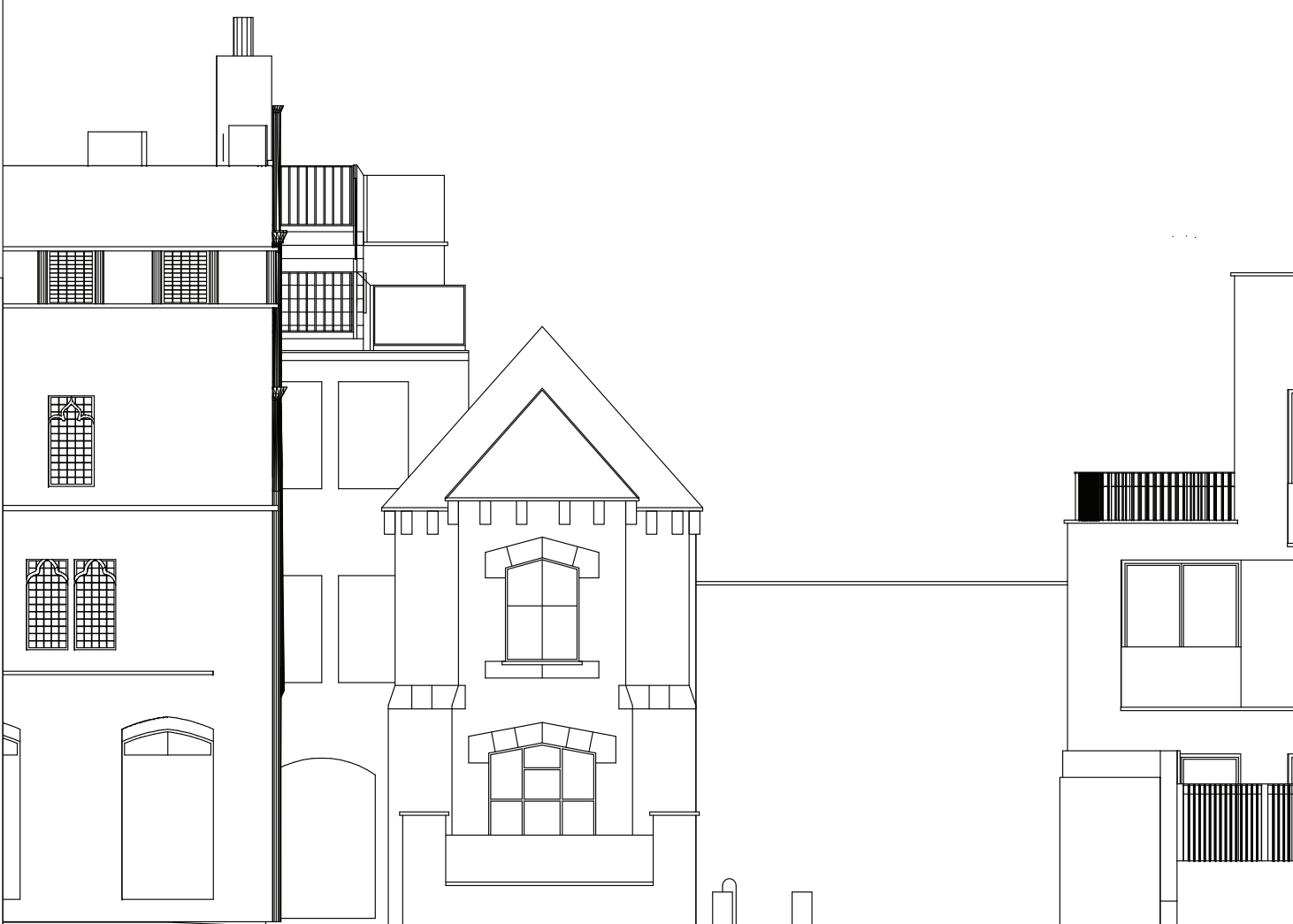
EXISTING SOUTH ELEVATION 1:100

Notes: Any discrepancies on this drawing with other documents to be reported immediately to the Contract Administrator for clarification