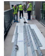
Terrace decking porcelain t to match L5 Johnson Build

3.3 The terraces shall not be accessible to the public and shall only be used by the occupants of the Johnson Garden Campus which includes the Johnson Building, 5 St Cross Street, 6-7 St Cross Street, 34 Leather Lane and 32 Leather Lane.