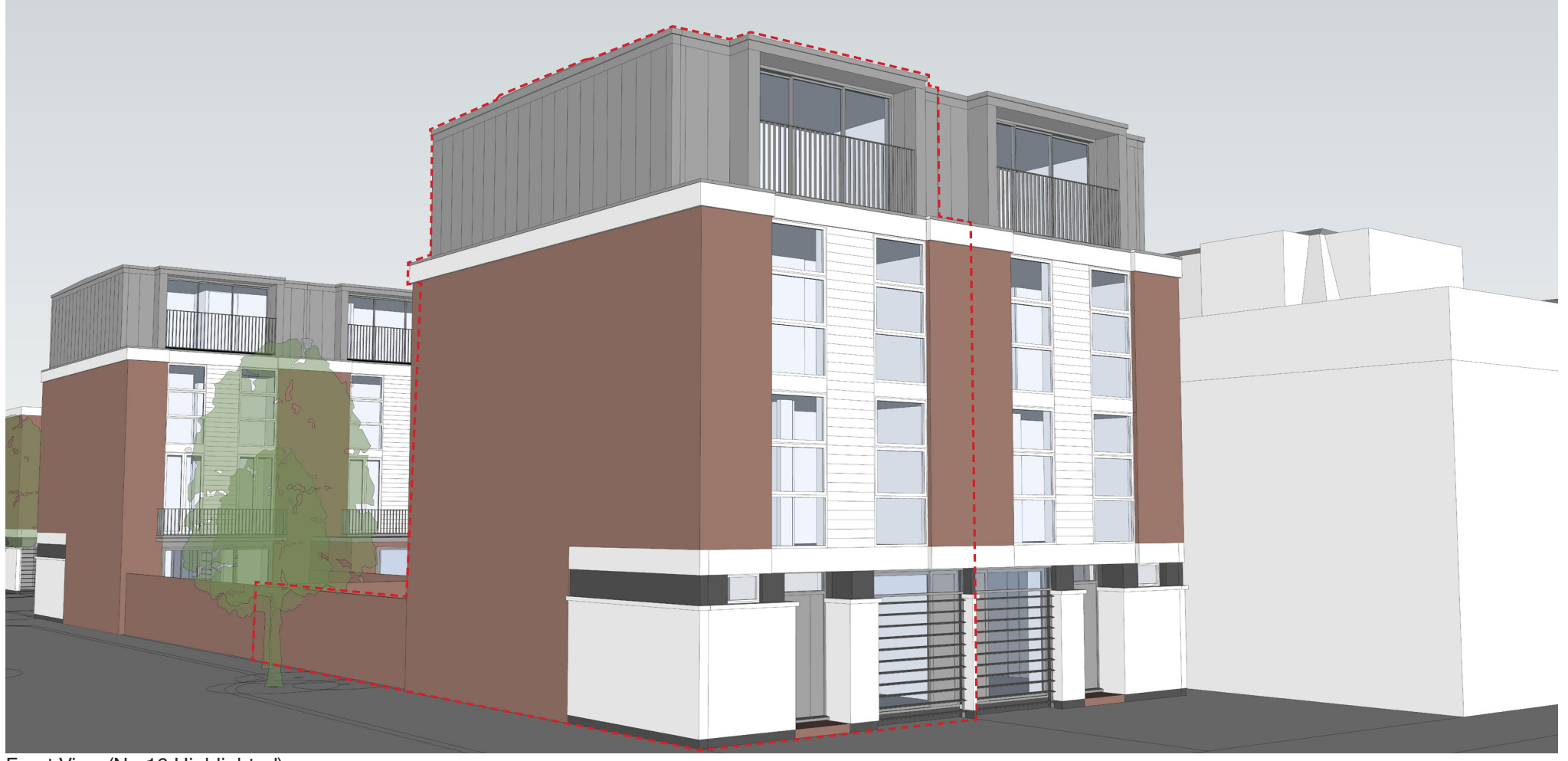
Front View (No.16 Highlighted)