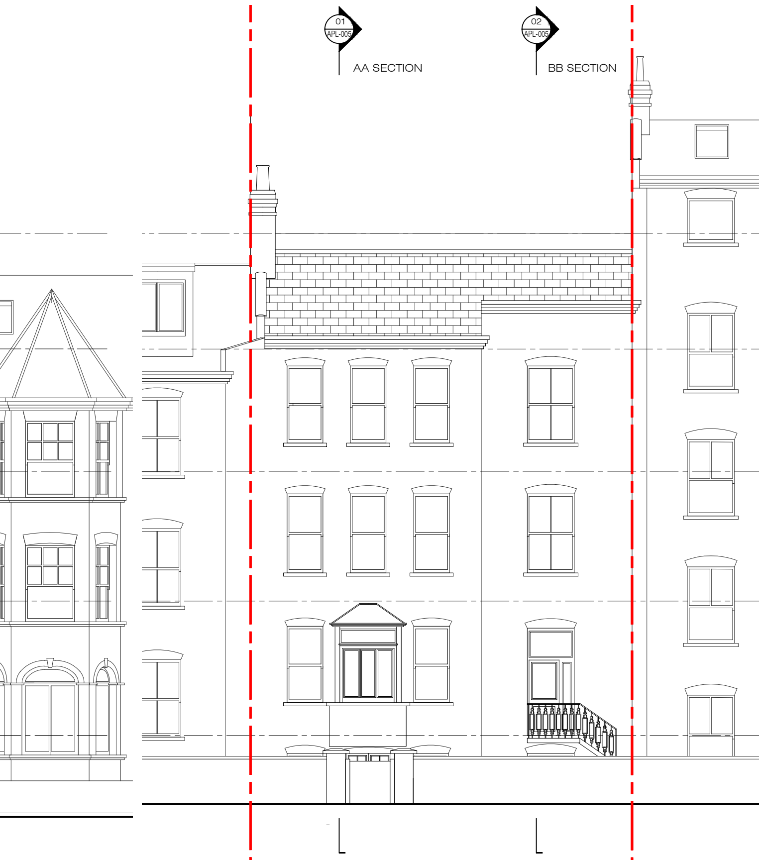
02 Rear Elevation scale: 1:100