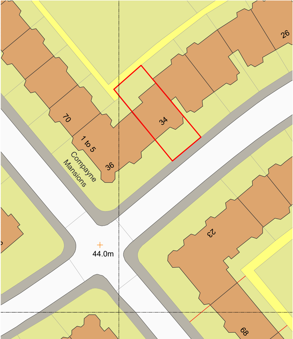
02 Block Plan scale: 1:500