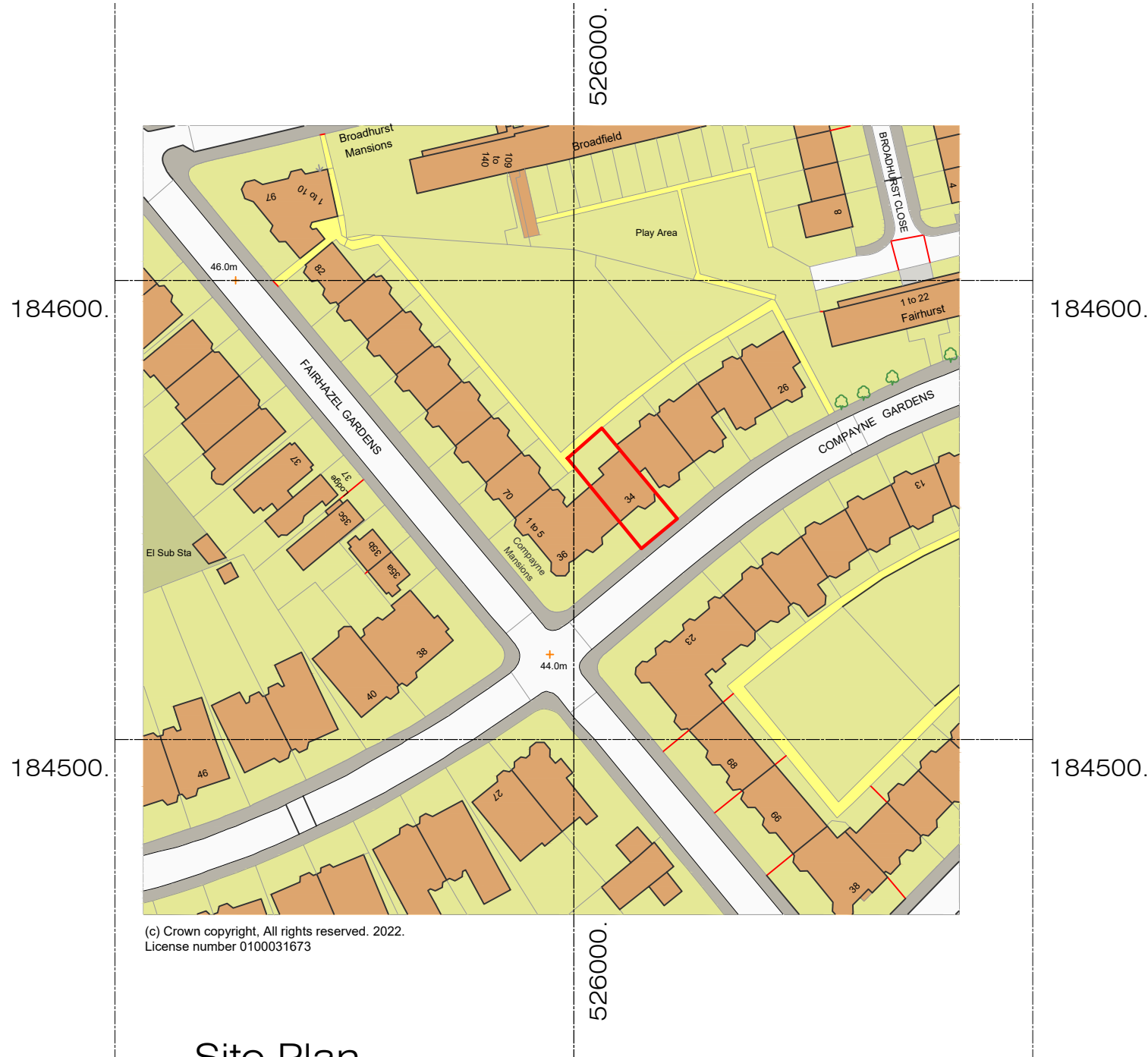
01 Site Plan scale: 1:1250