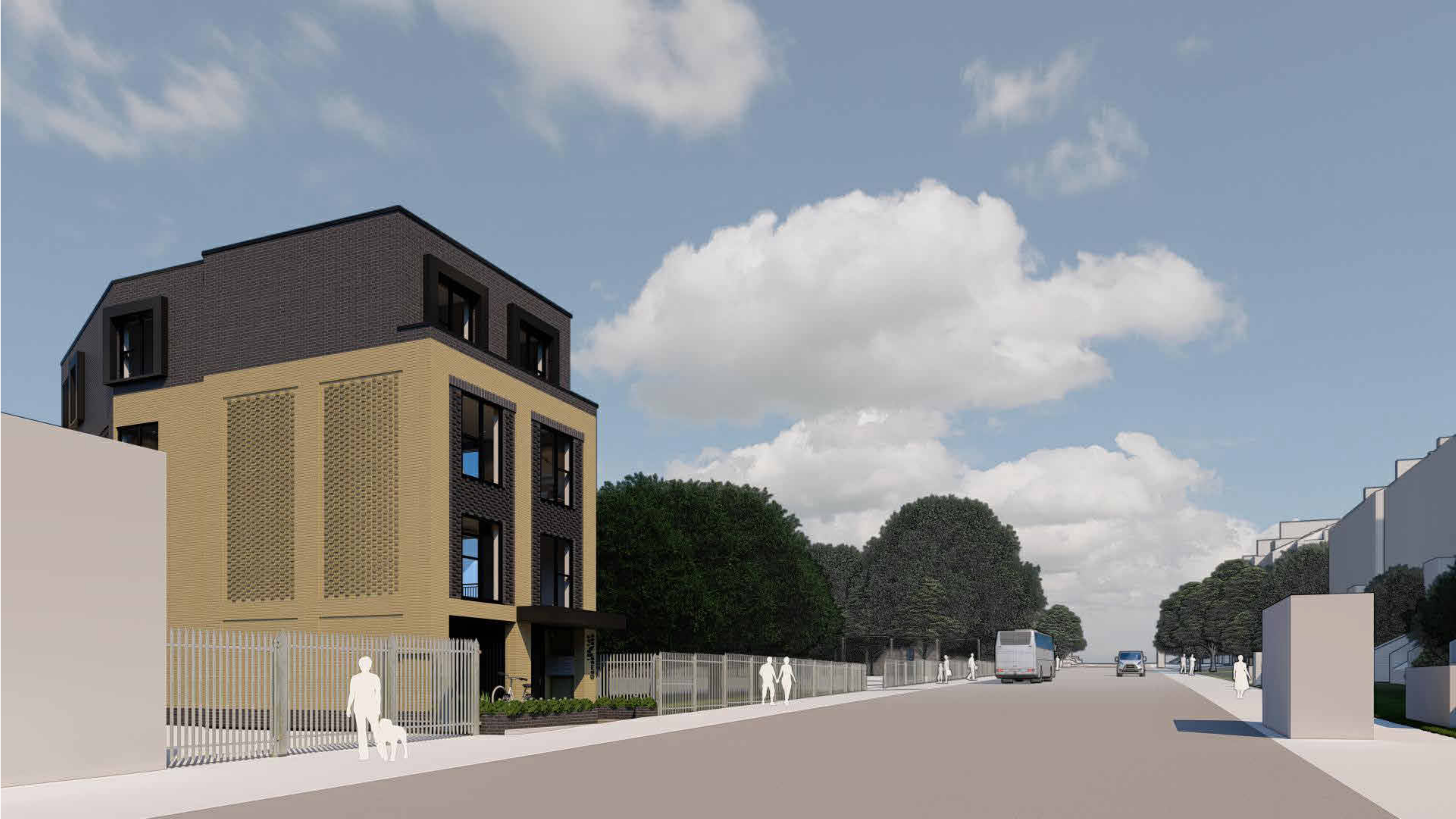
Proposed 3D Visual - Facing South West