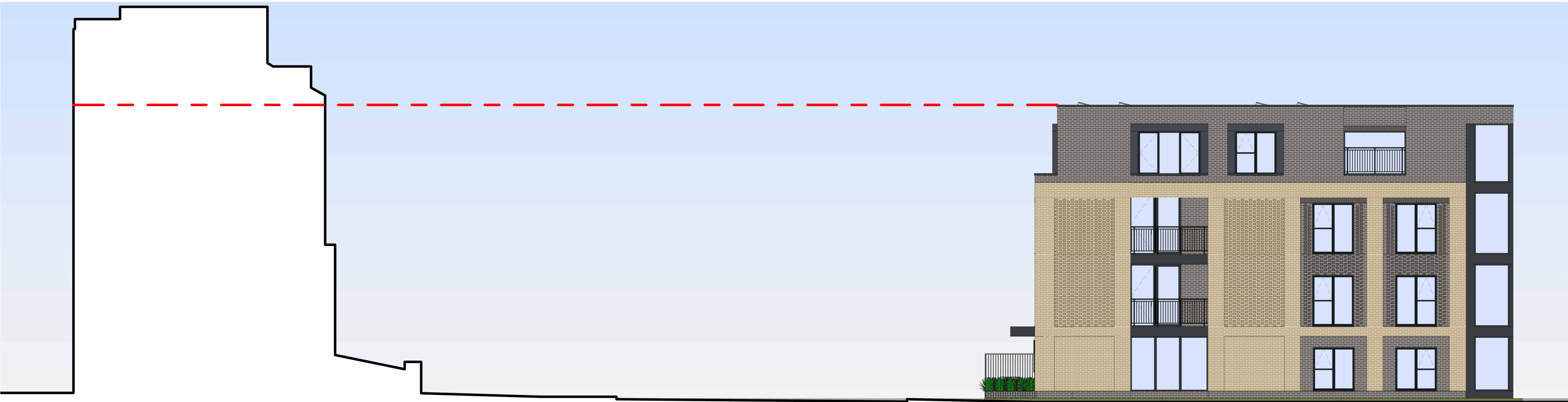
Camden Road Facing South West