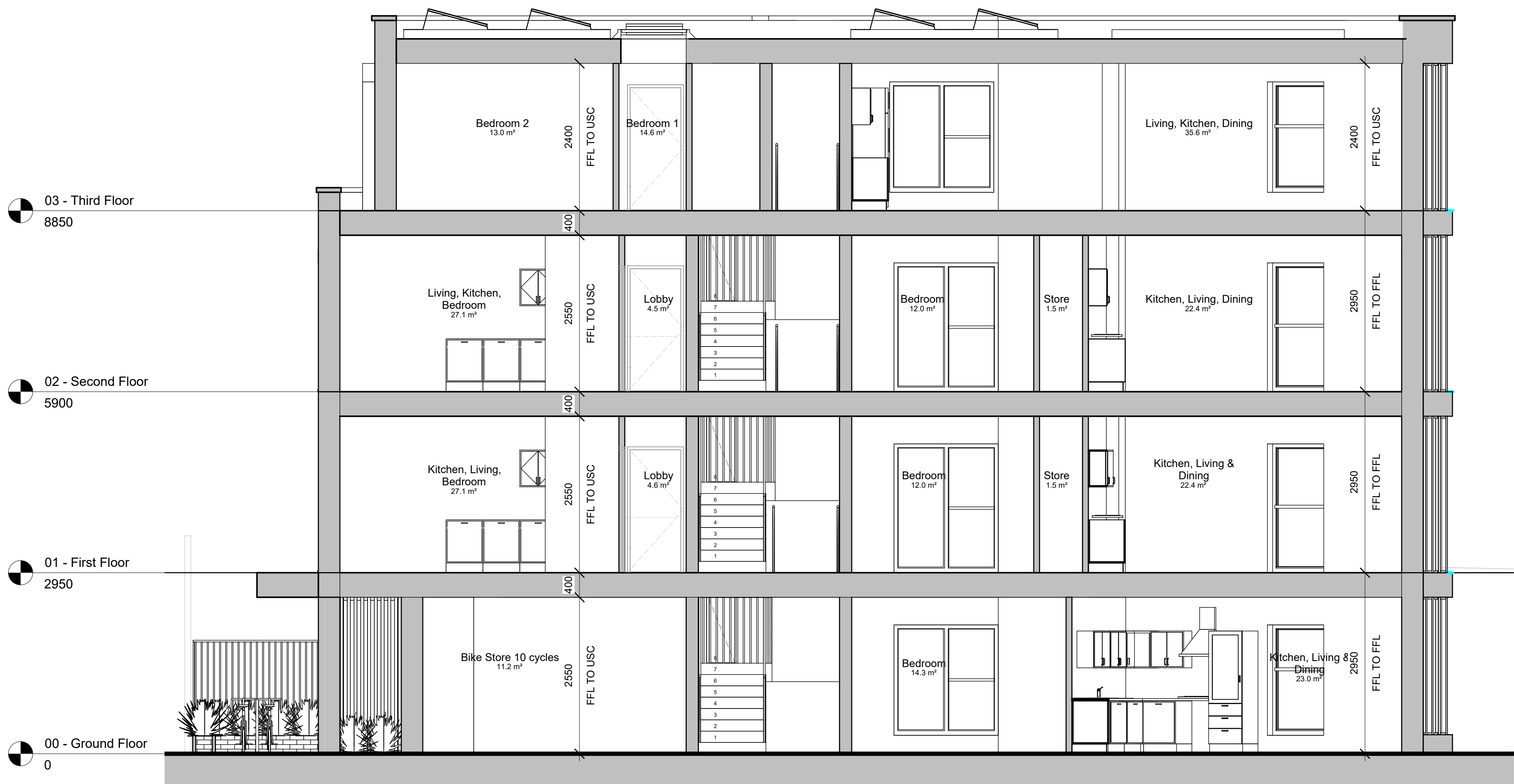
Section A-A 1 : 50