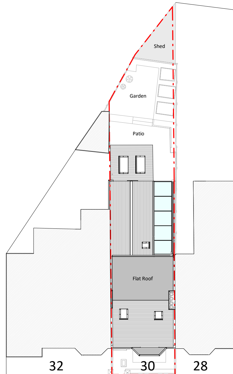
Proposed Block Plan