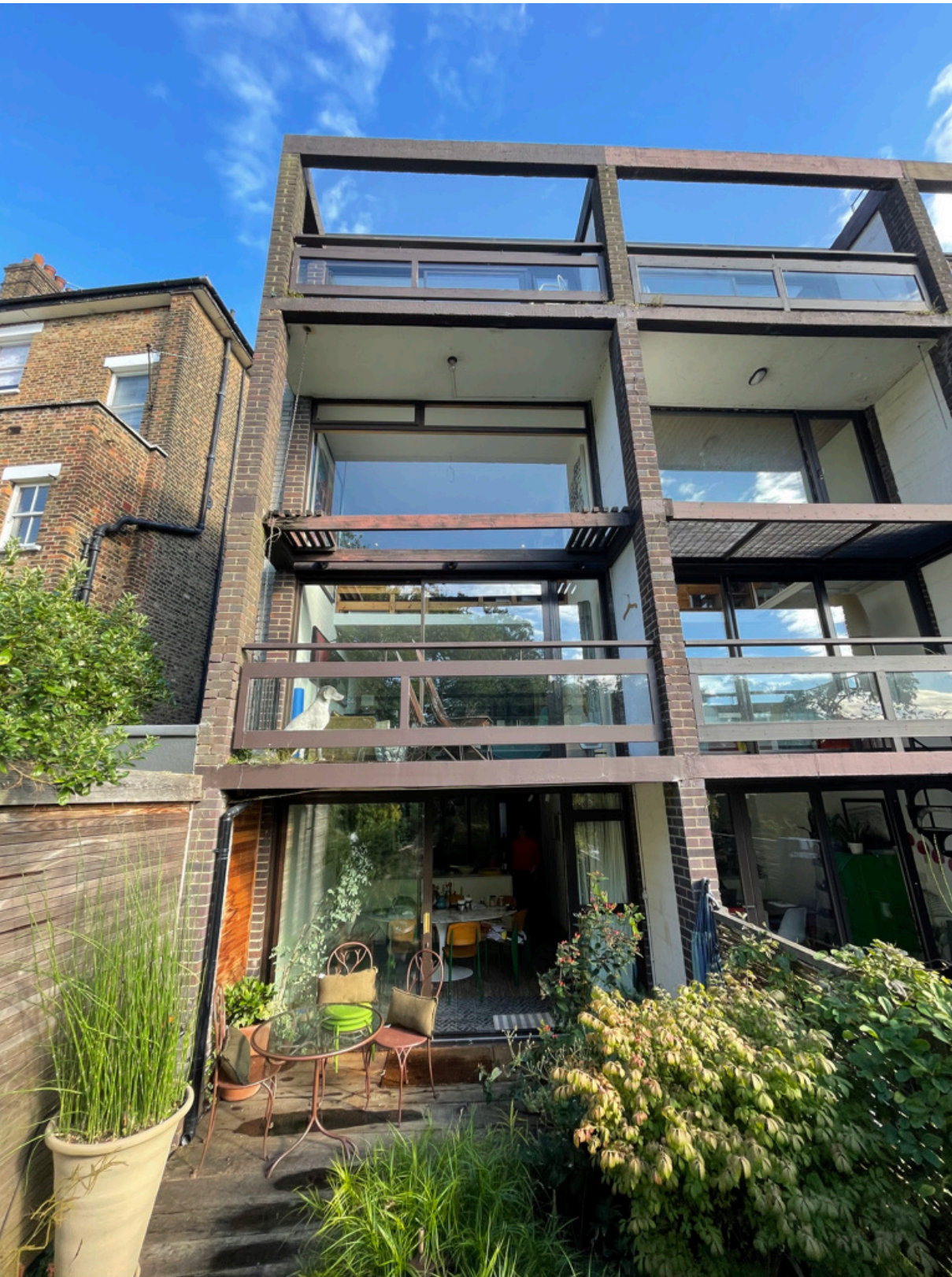
Existing Rear View

NOTES © This drawing copyright Barnaby Gunning 2022 Do not scale from this drawing. Dimensions to be verified on site prior to construction. Unless otherwise indicated, all dimensions are in millimetres.