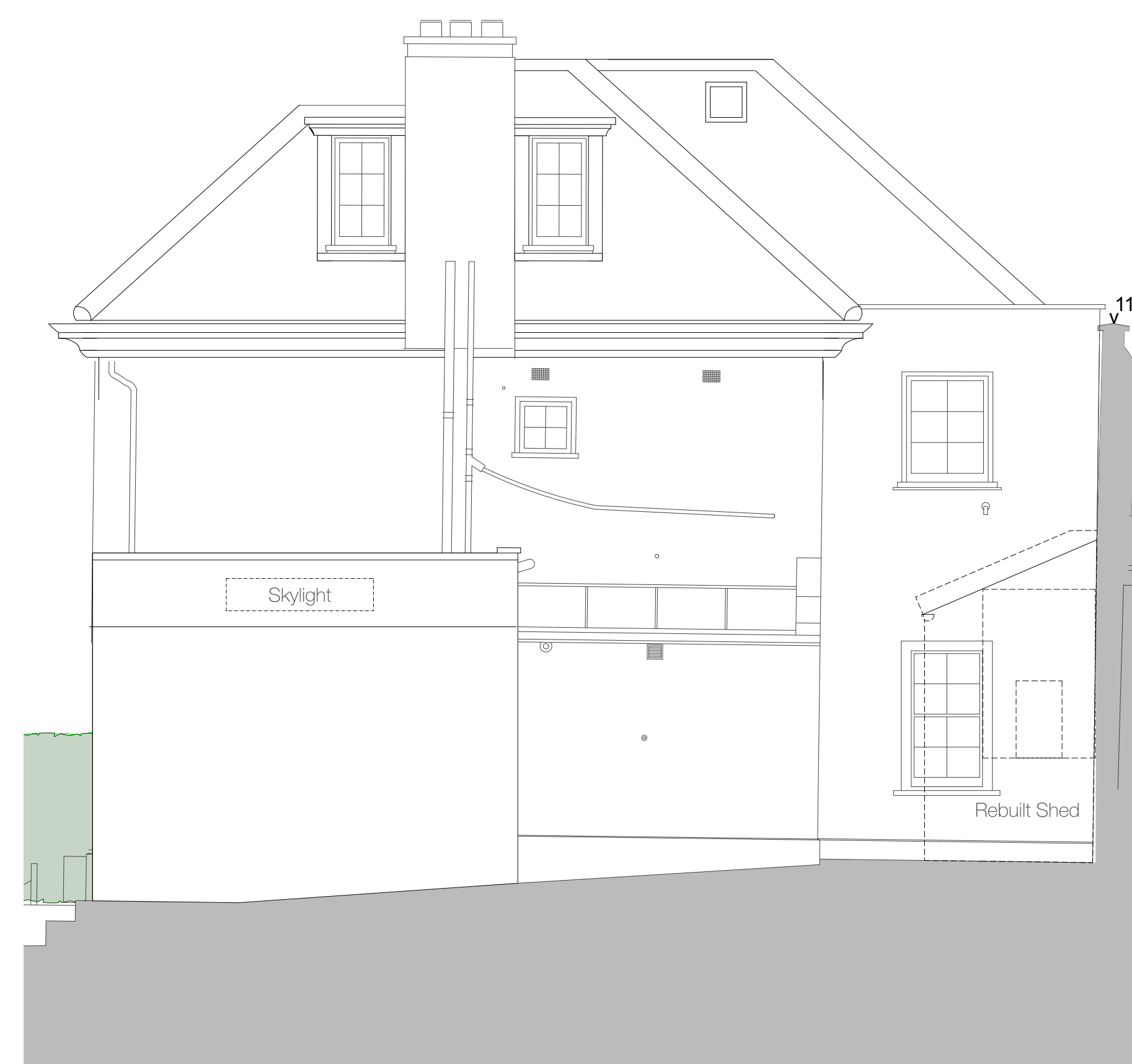
Existing North Elevation 1:50

Utility window shifted to align with new interior layout