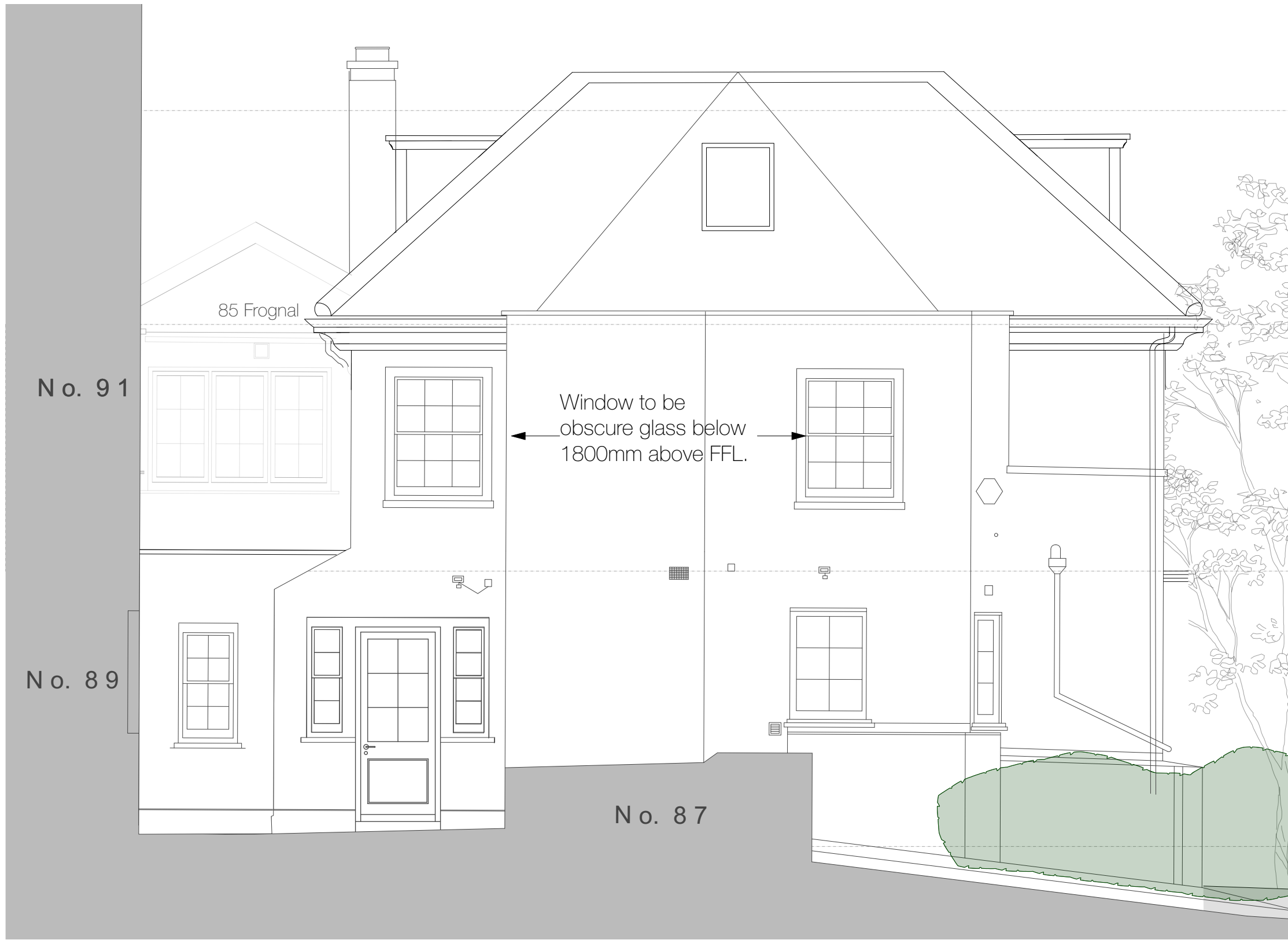
Existing West Elevation 1:50

In the event of any detail or dimensional conflict between Charlton Brown Architects drawings, the matter must be referred back to Charlton Brown Architects for clarification