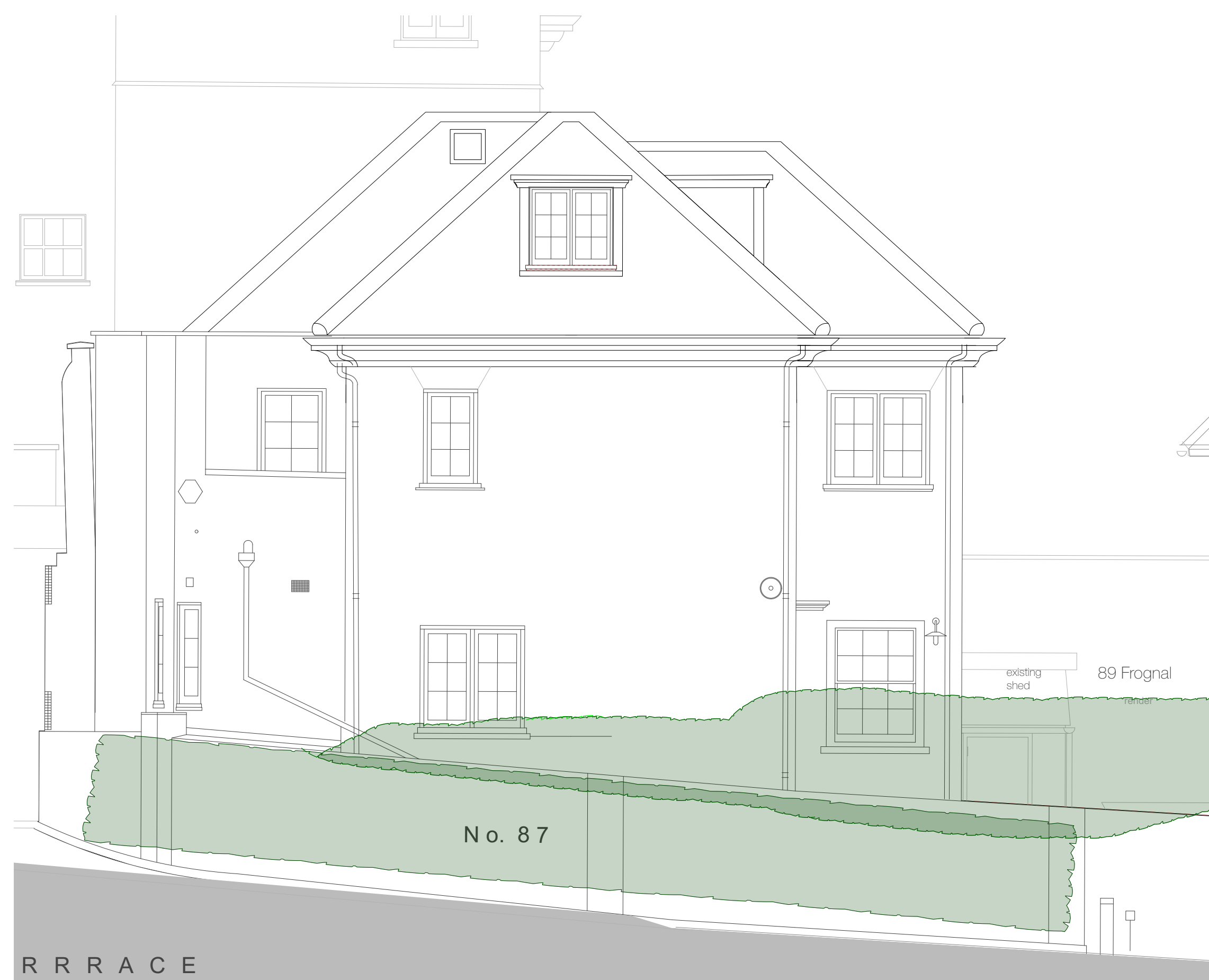
Existing South Elevation 1:50

Dead hedge along wall removed and new privacy trellis proposed to a height of 1100mm above terrace FFL.