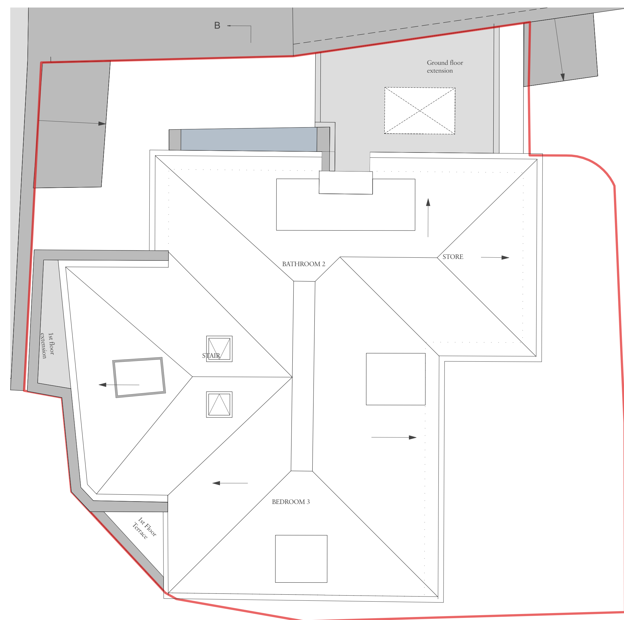
Existing Roof Plan 1:50

Flanking dormer windows widen inwards by 100mm but outer dormer envelope remains the same.