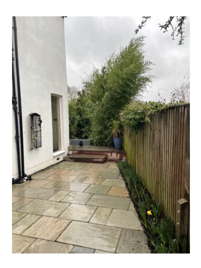
Side Passage Towards Rear Garden