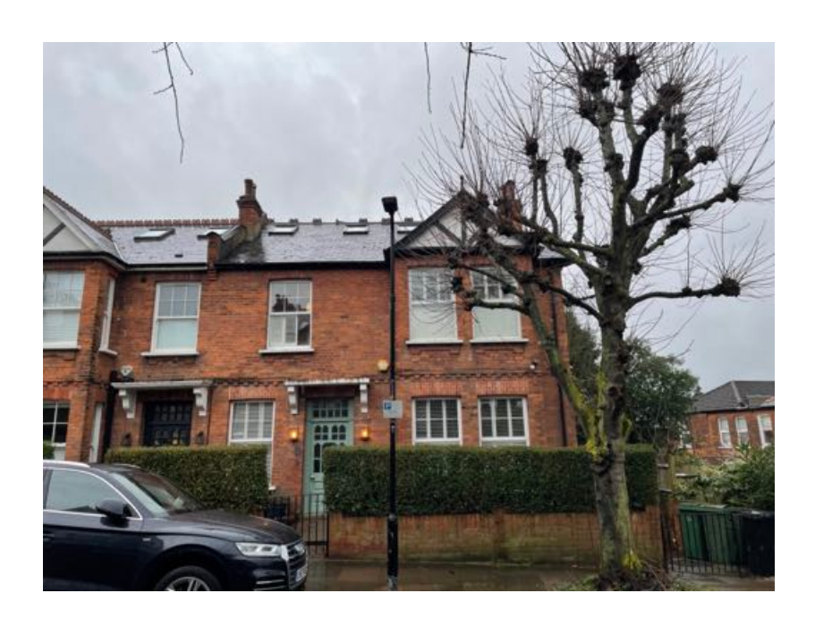
Front Elevation from St Gabriels Road