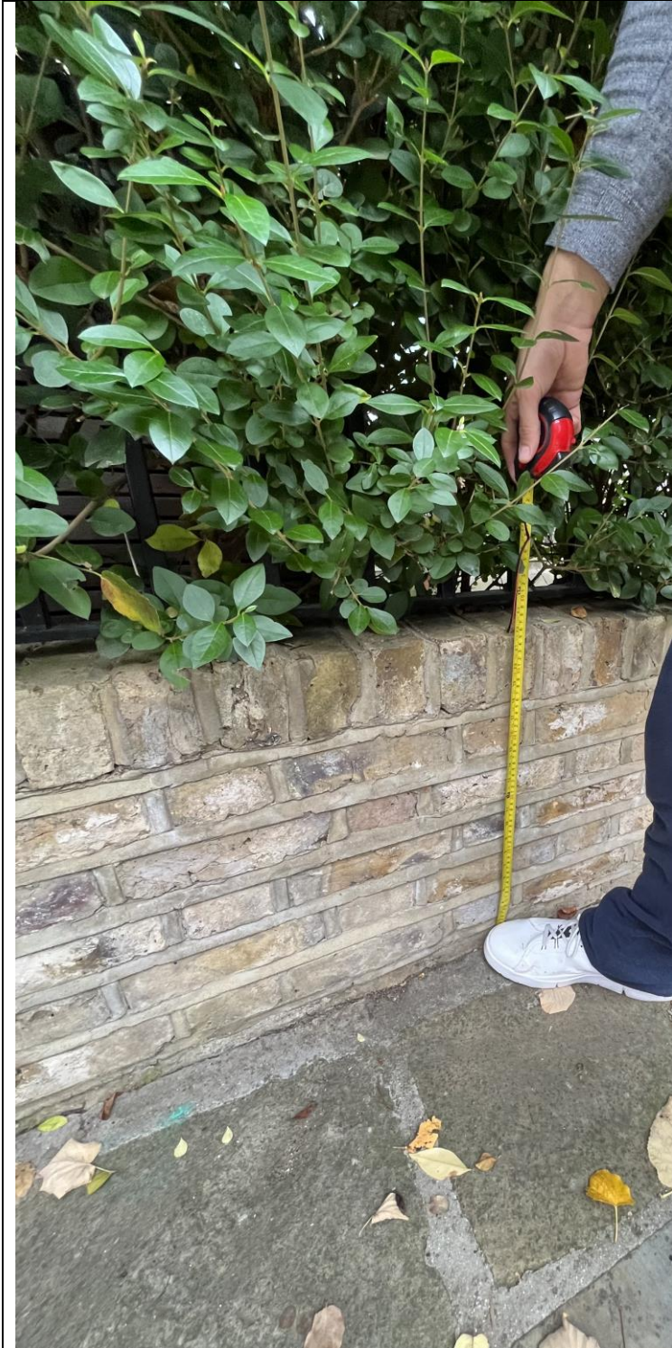
Roderick Road, 55cm