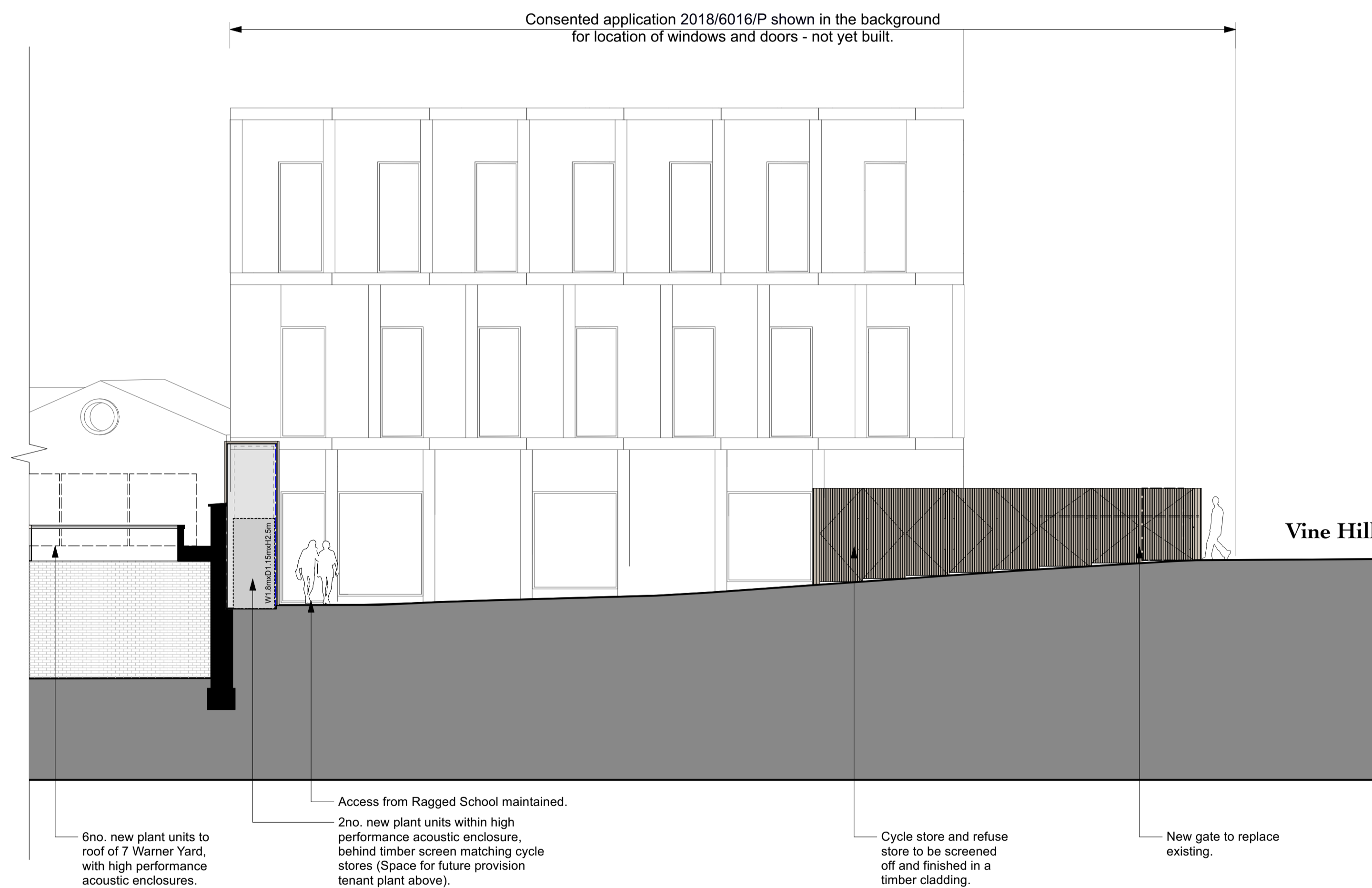
1 Proposed Elevation - West (Courtyard) Scale: 1:100