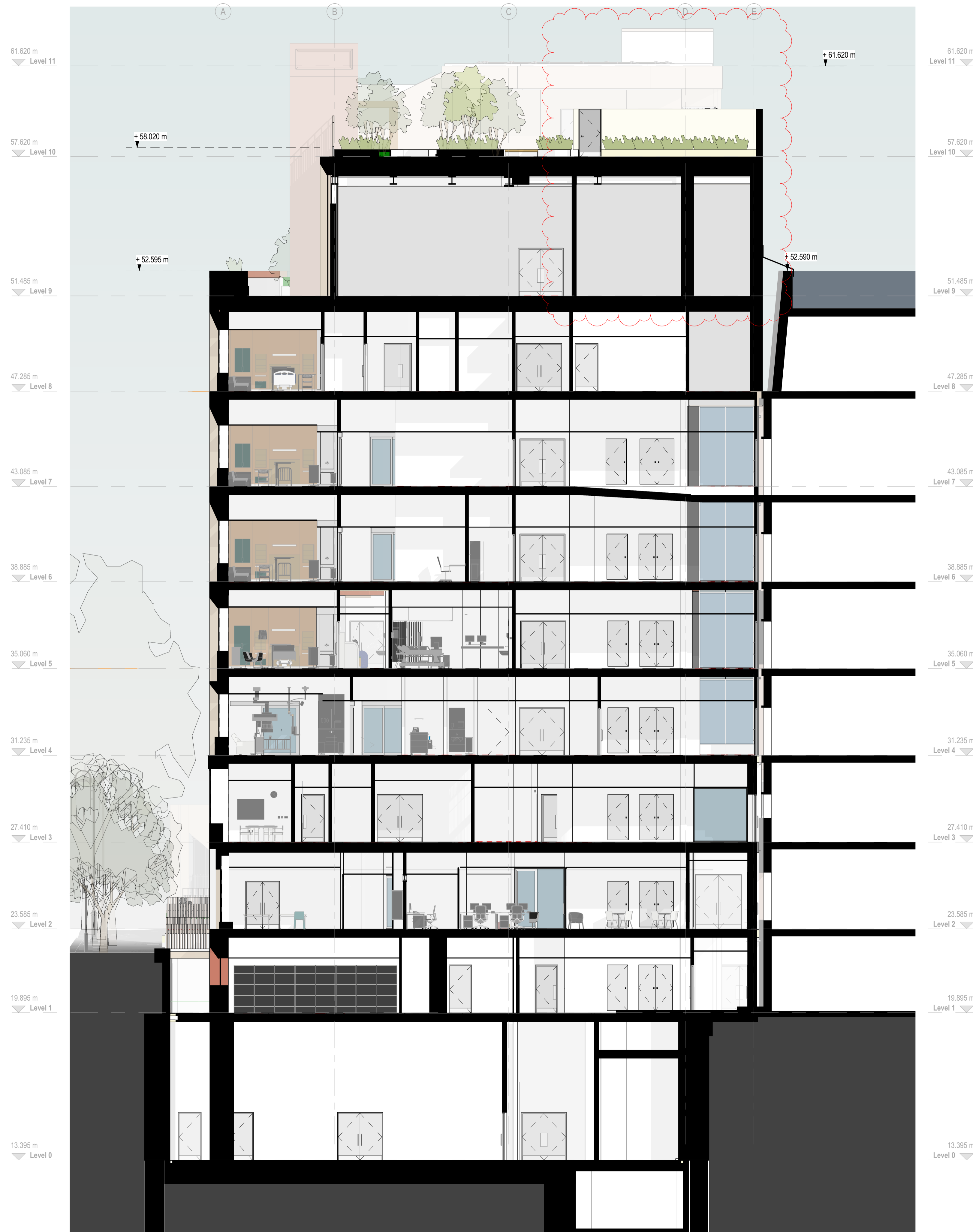
Section E-E - PICB as Proposed T: 100