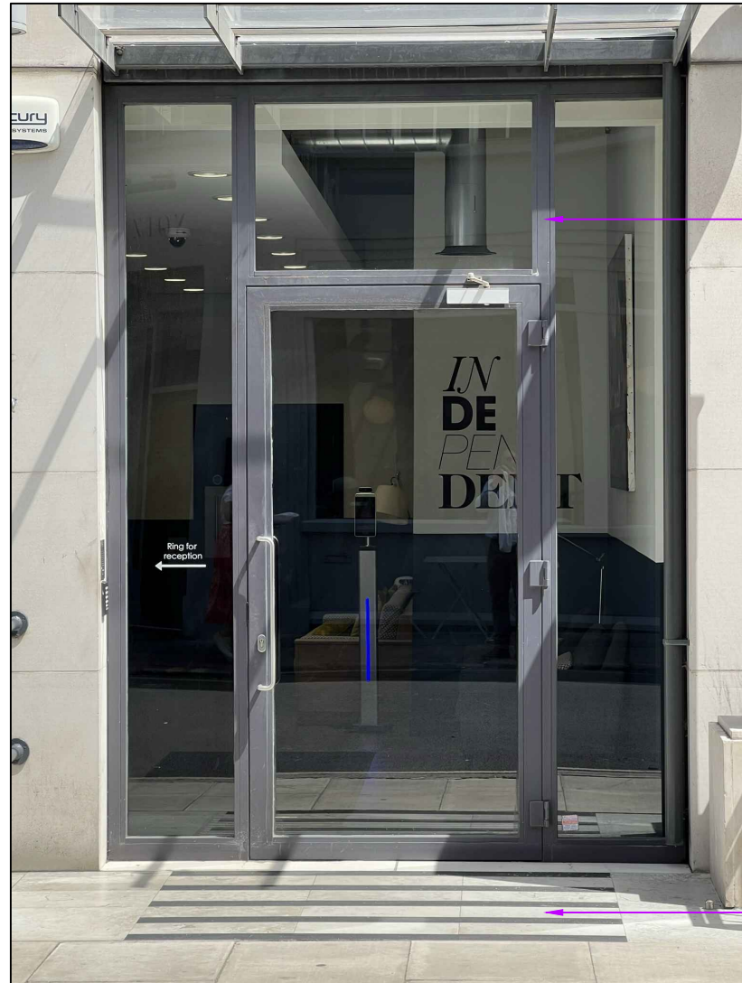
EXISTING 40 WHITFIELD STREET ENTRANCE TO BE MATCHED