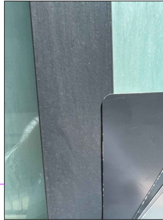
New Aluminium door finish to match RAL 7024