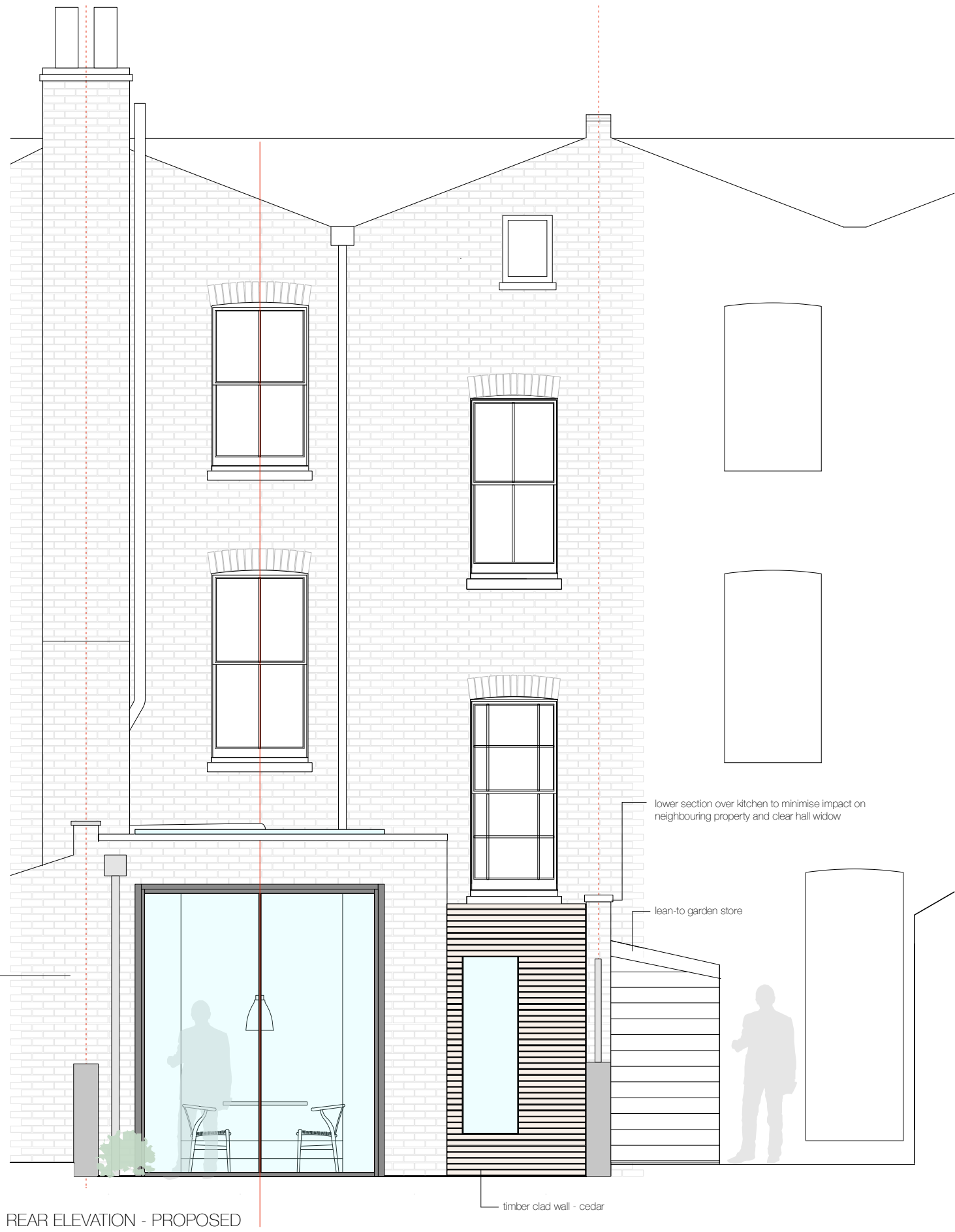
REAR ELEVATION - PROPOSED