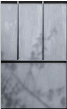
QUARTZ-ZINC pre-patinated zinc cladding