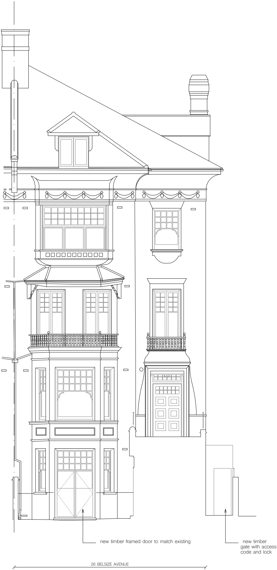
1 proposed front elevation