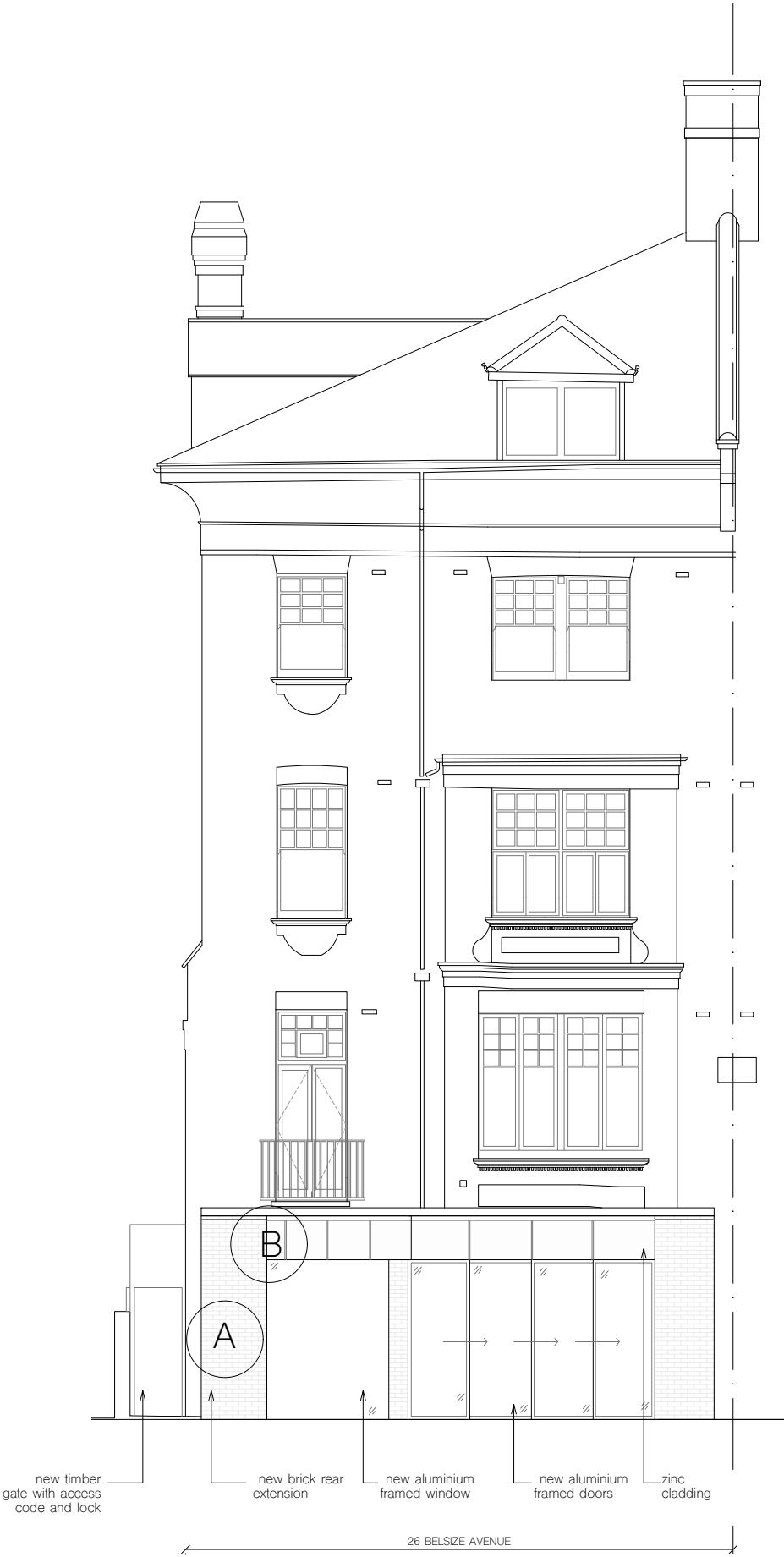
2 proposed rear elevation