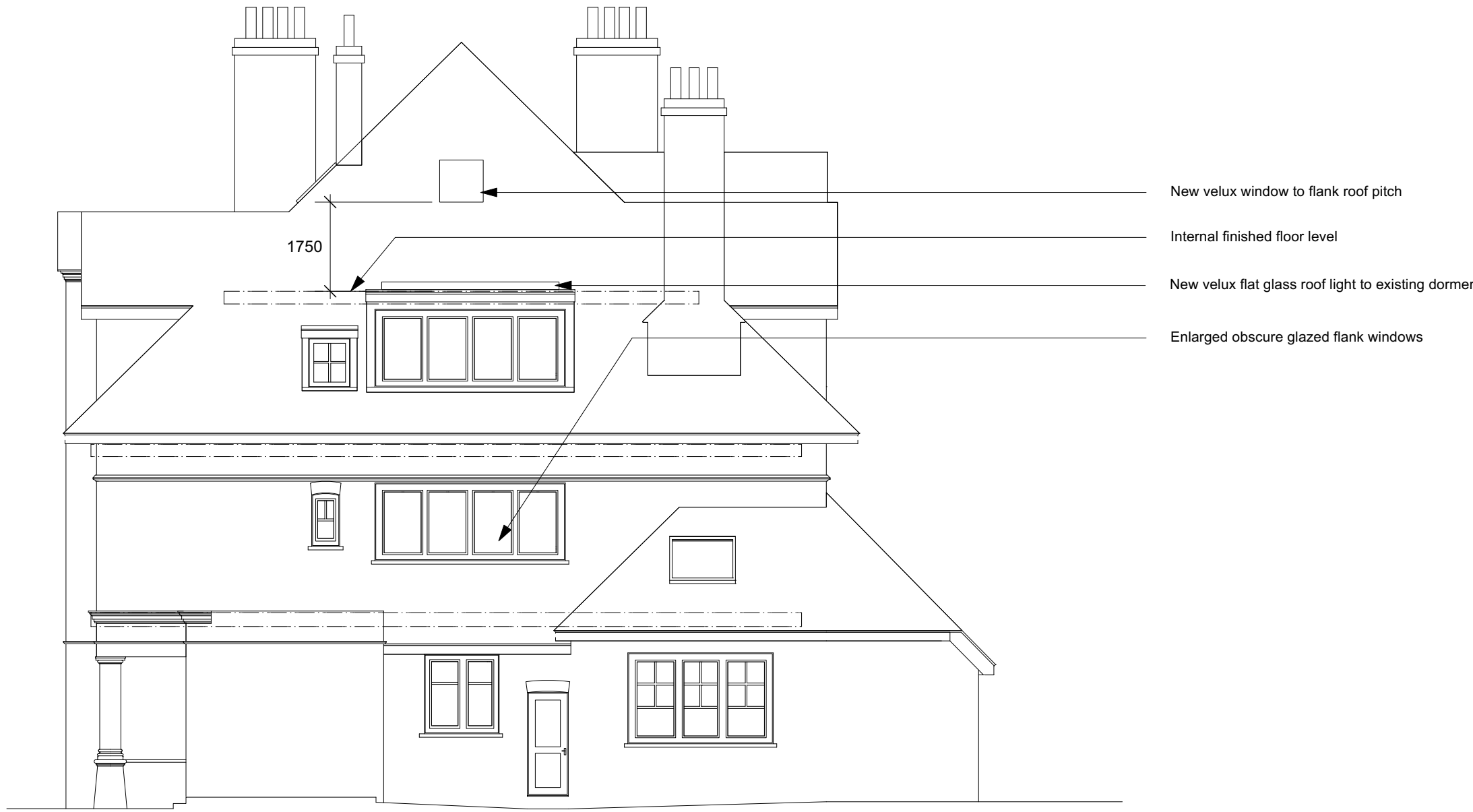
Proposed East elevation