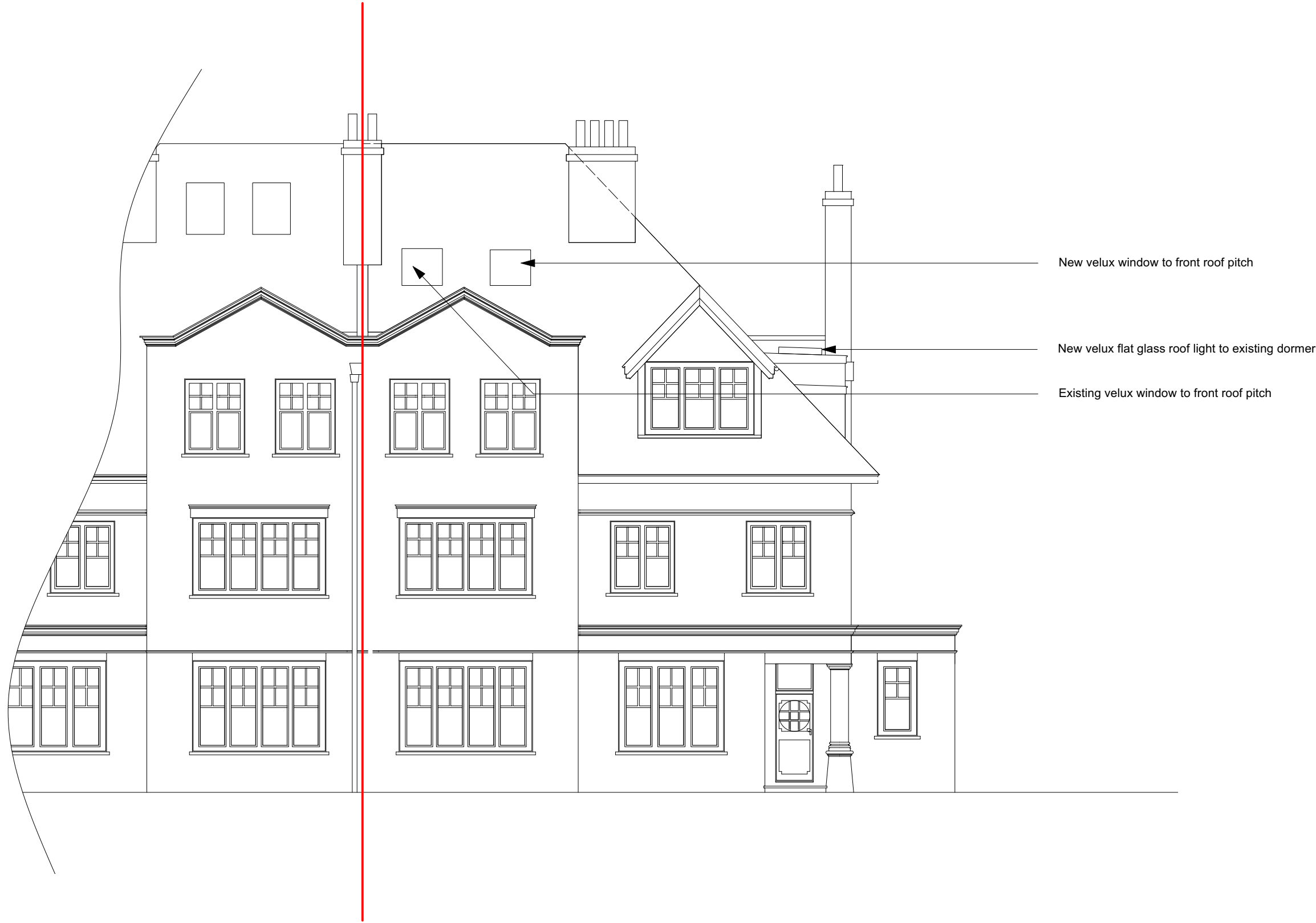
Proposed South elevation

In the event of any detail or dimensional conflict between Charlton Brown Architects drawings, the matter must be referred back to Charlton Brown Architects for clarification