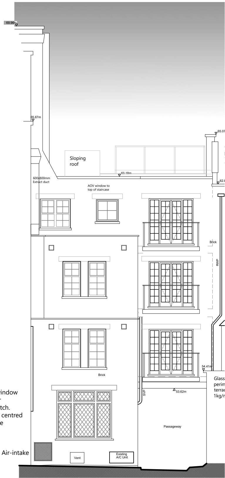
Datum 48.000m AD Rear Elevation