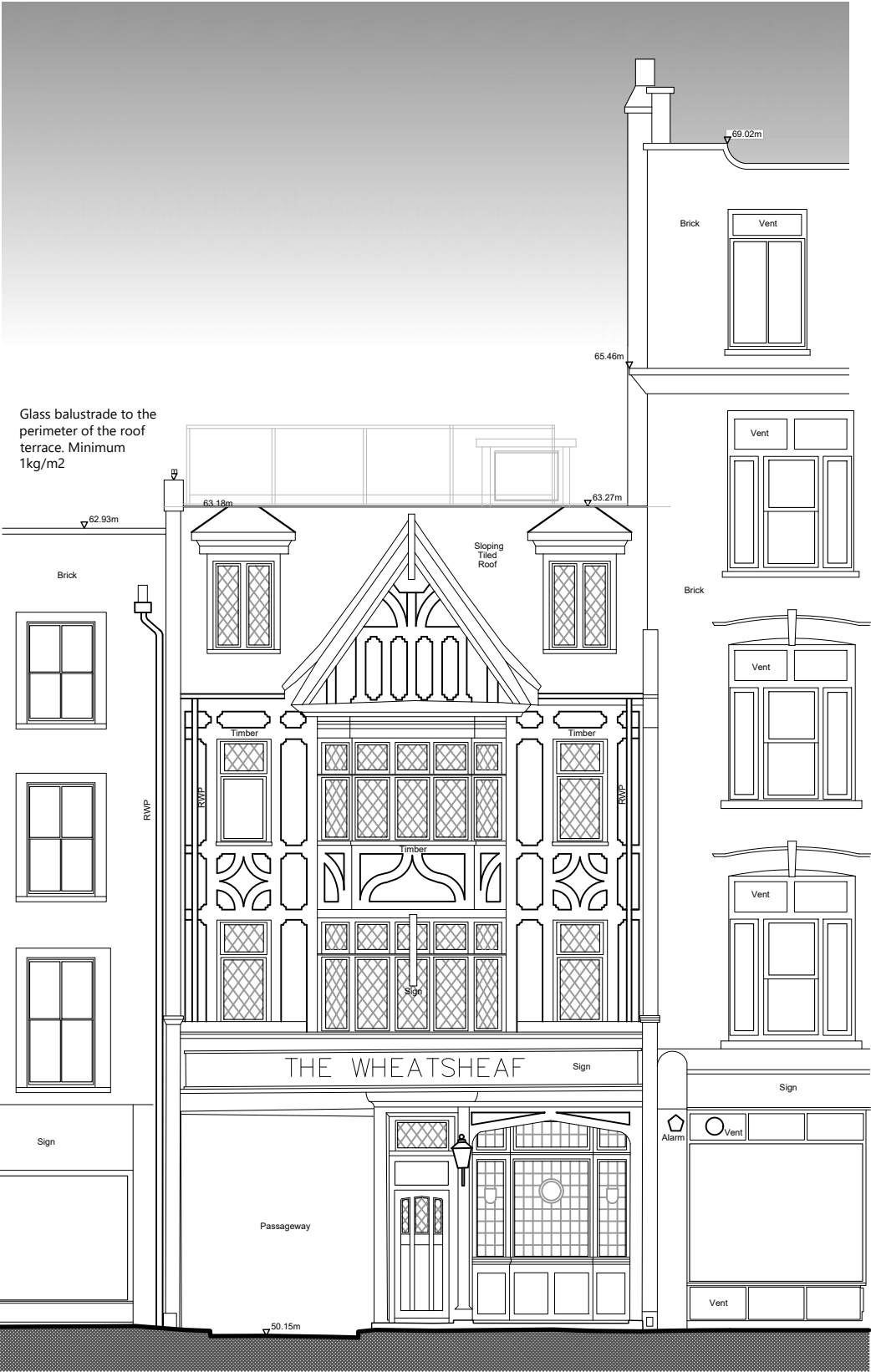
Datum 48.000m AD Front Elevation