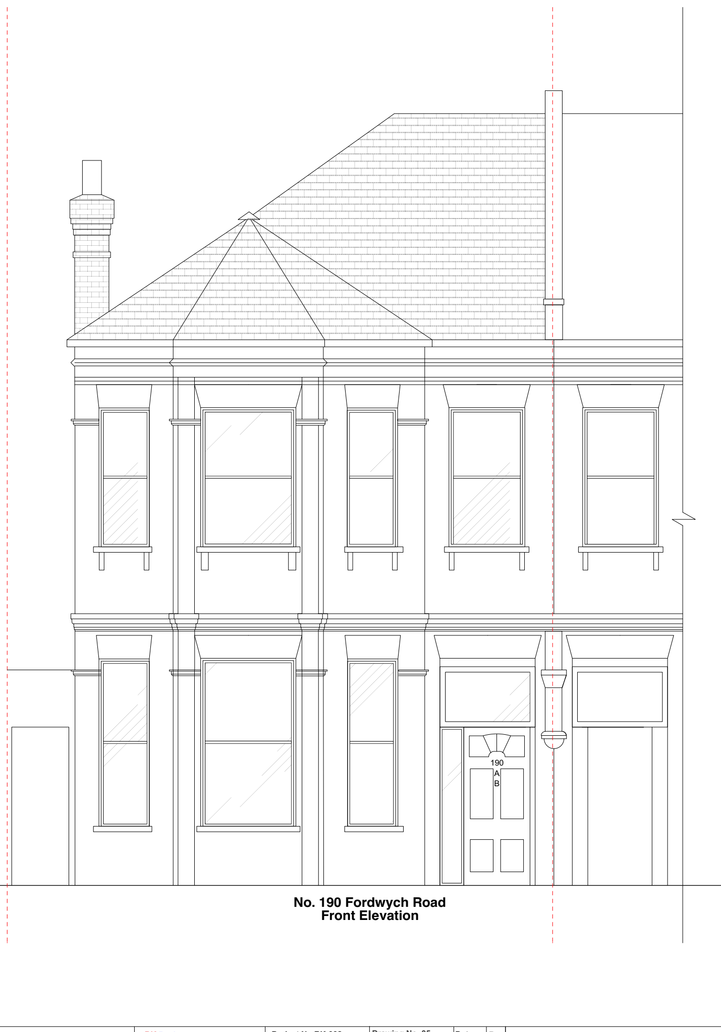
No. 190 Fordwych Road Front Elevation