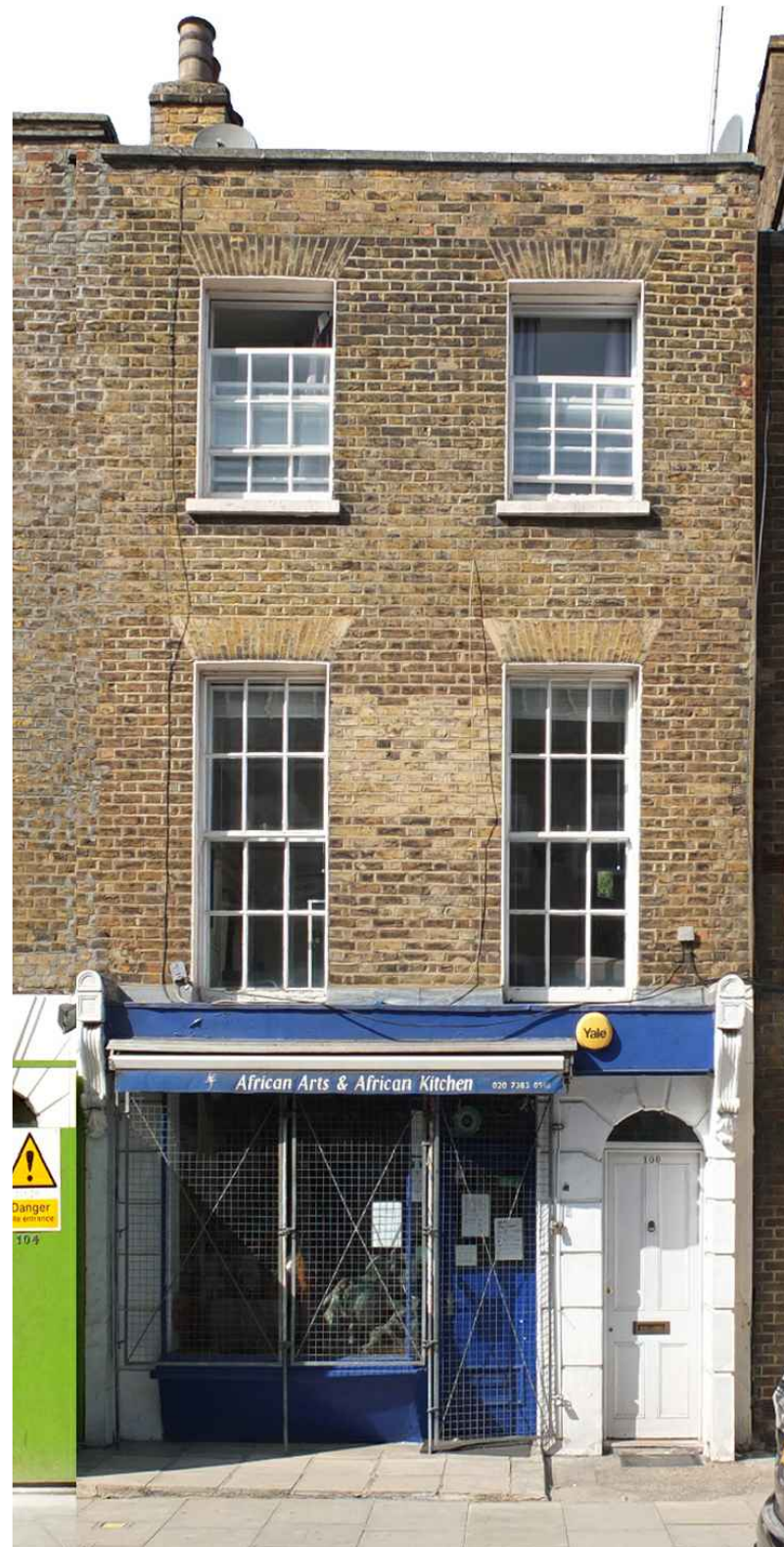
02 Existing Photo Elevation