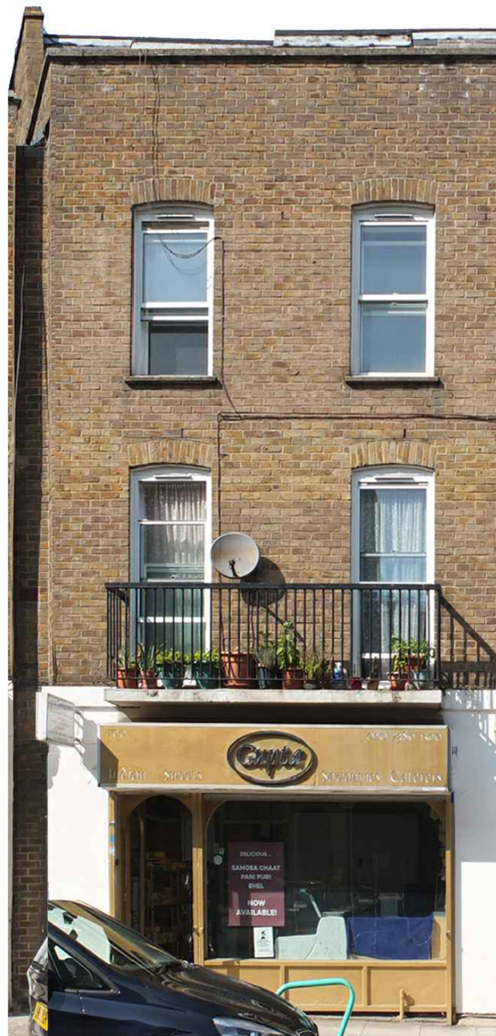
02 Existing Photo Elevation