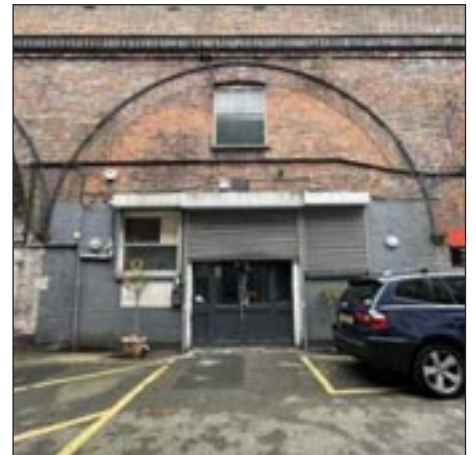
Arch 14A - Marketing Company