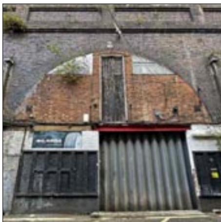
Arch 15 - Vacant/ Photo Studio