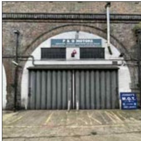
Arch 10A - Vacant