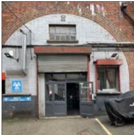
Arch 13A - Southern Cross Motorbikes