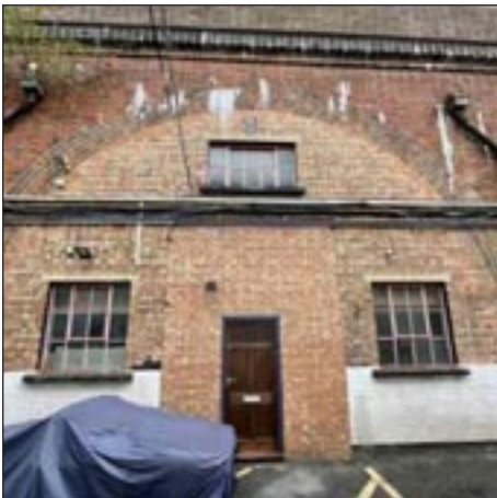
Arch 12A - Kilburn State Of Mind