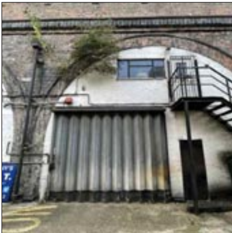
Arch 9A - Vacant