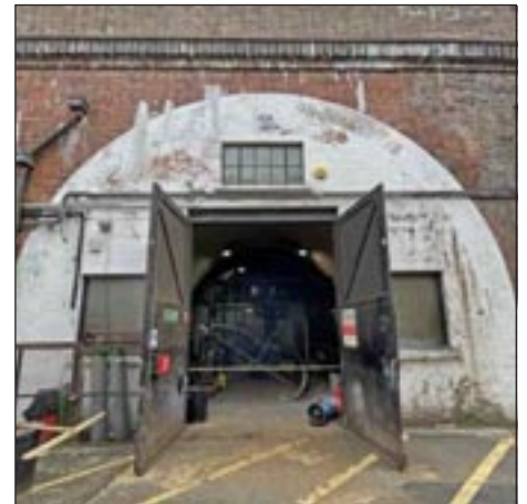
Arch 11A - Kalliopi Lemos