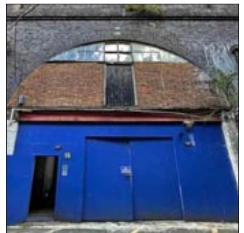
Arch 16/17 - Photo/Dance Studio