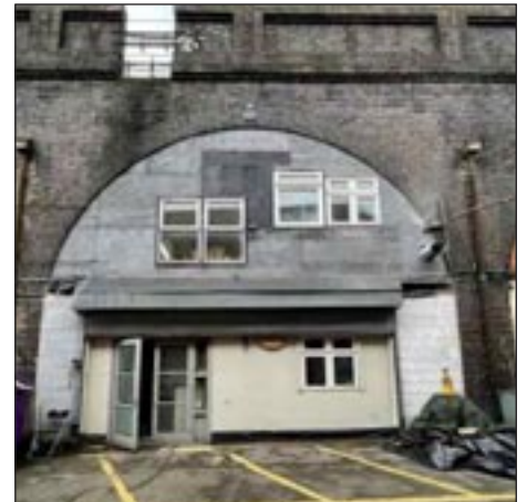
Arch 13 - Kraftwork Furniture Maker