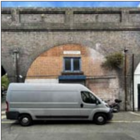
Arch 11 - Uknown Artists