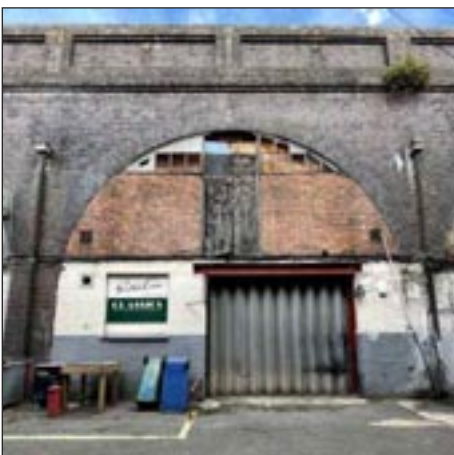
Arch 14 - Kraftwork / Photo Studio