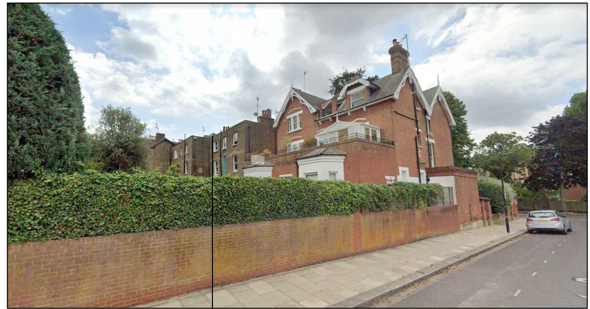
VIEW FROM LANCASTER DRIVE SHOWING THE TOP OF 41 LANCASTER GROVE EXISTING ROOF STAIR ENCLOSURE ONLY