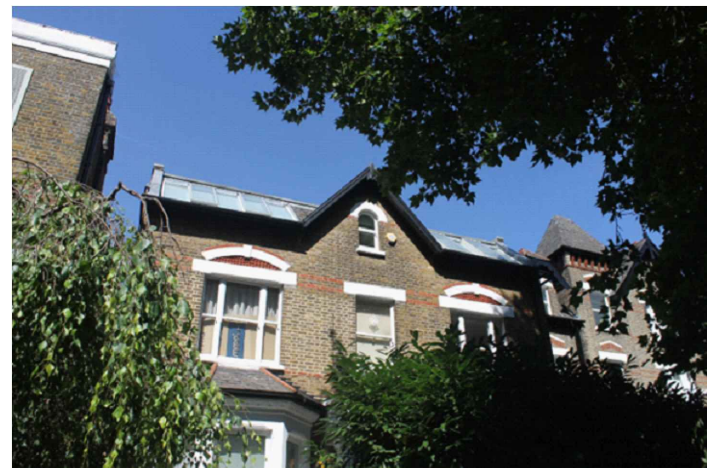
VIEW LOOKING UP FROM STREET LEVEL FROM LANCASTER GROVE