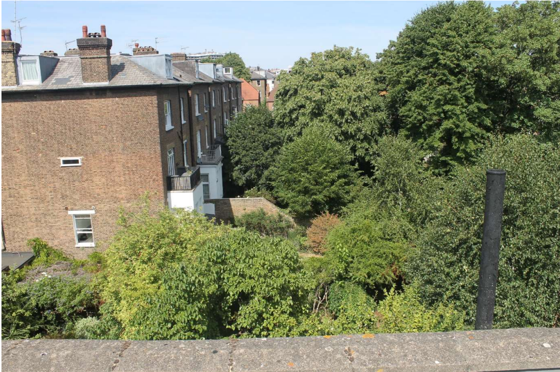
Looking towards rear garden and terraces beyond.