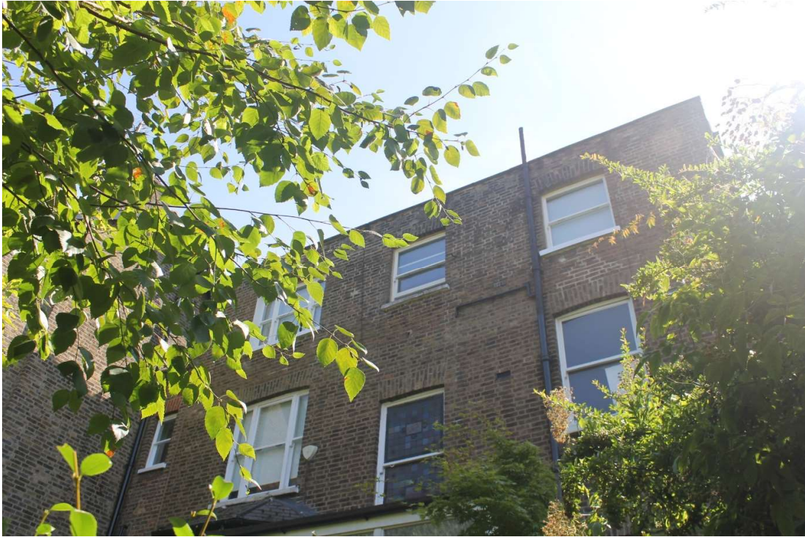
41 Lancaster Grove. Rear elevation as seen from end of Ground floor garden