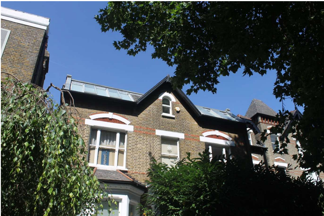
41 Lancaster Grove front elevation, with Top floor flat visible as seen from opposite street level.

PLANNING APPLICATION REF. 2022/2441/P 41 Lancaster Grove NW3