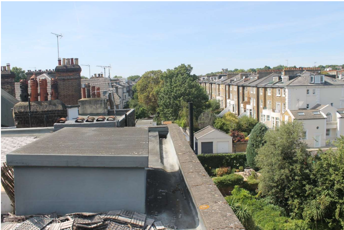
View from flat roof above Top Floor Flat at 41 Lancaster Grove. Looking north, with enclosed water tank in front.