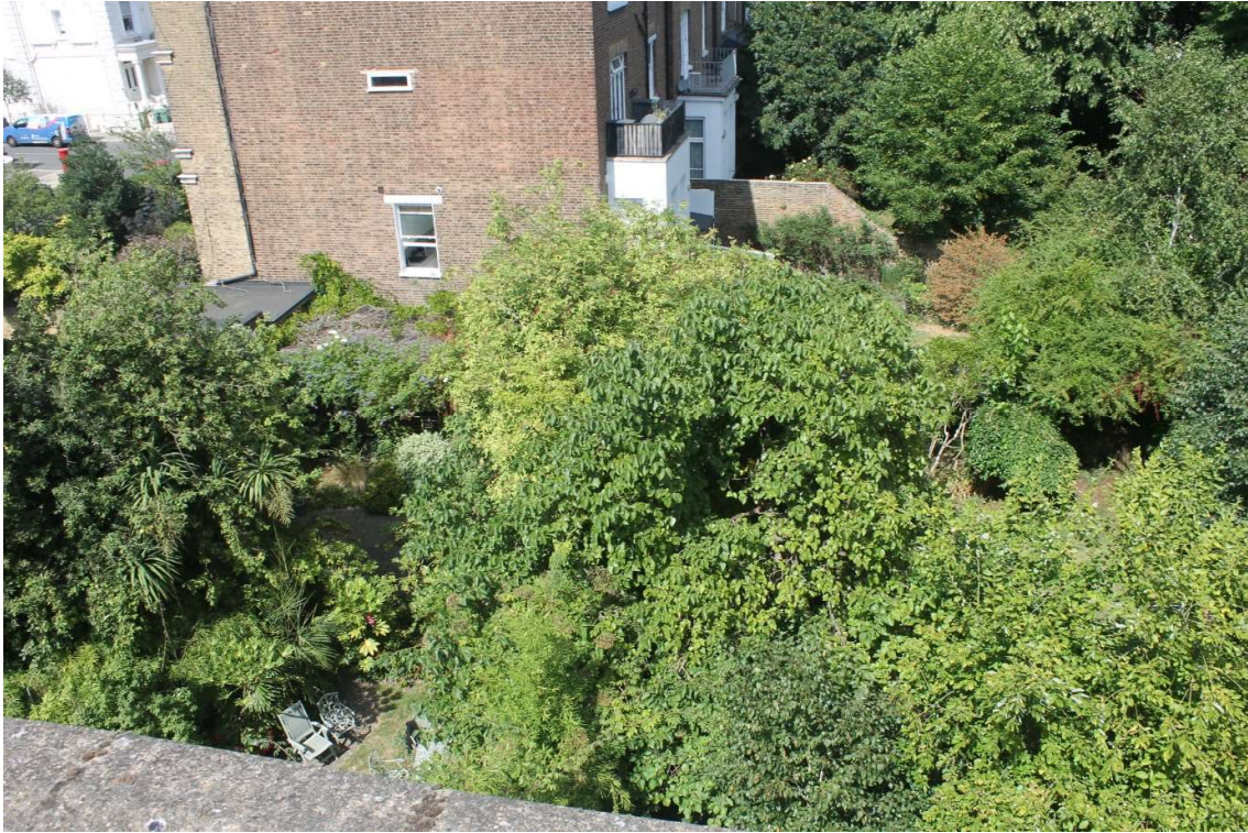
Looking down onto 41 Lancaster Grove ground floor garden.