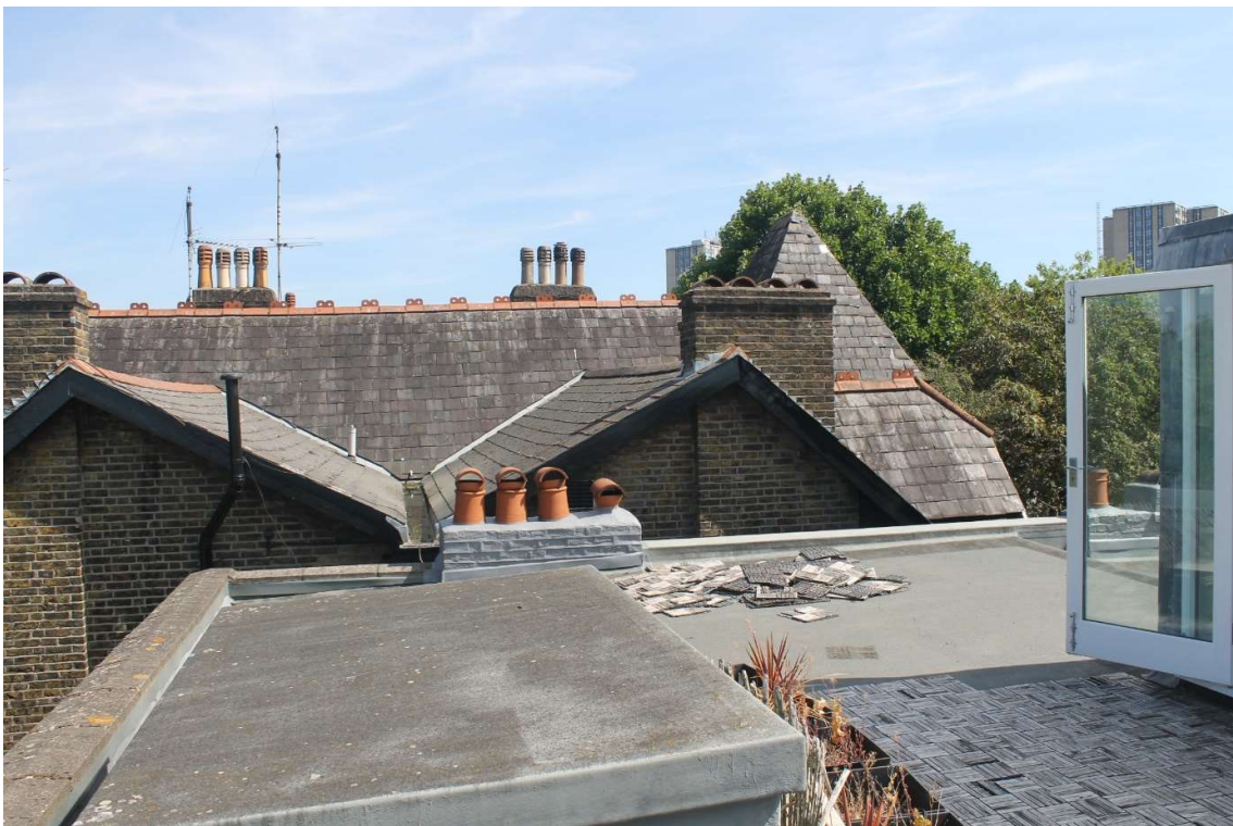
Looking South towards neighbouring property, and existing staircase enclosure visible on right-hand side of image.